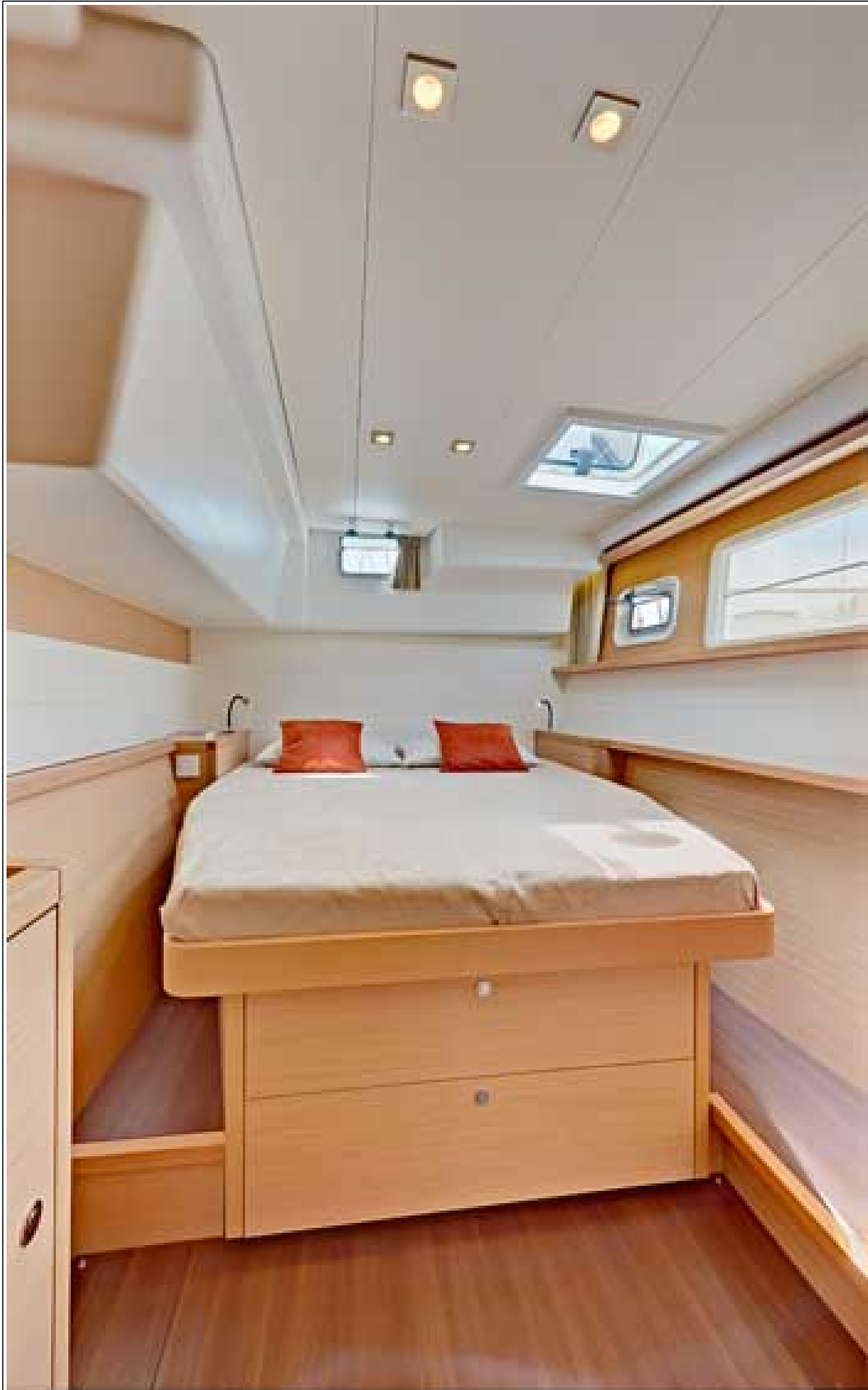
Yacht 001 - Horizon 40000 / Mercedes 1000 / Power House Care