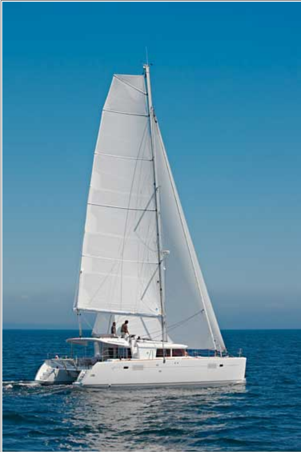
Lagoon 450 - Brest - Anguilla - Saint-Pierre - Photo: Nicolas Chéris