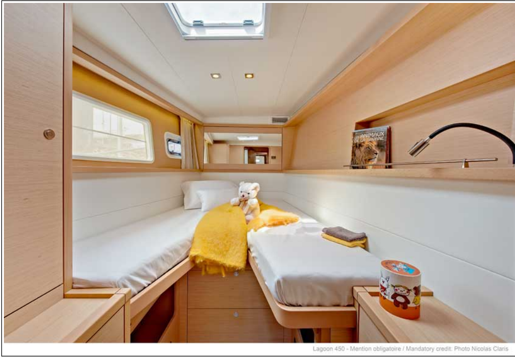
Lagoon 450 - Mention obligatoire / Mandatory credit: Photo Nicolas Claris