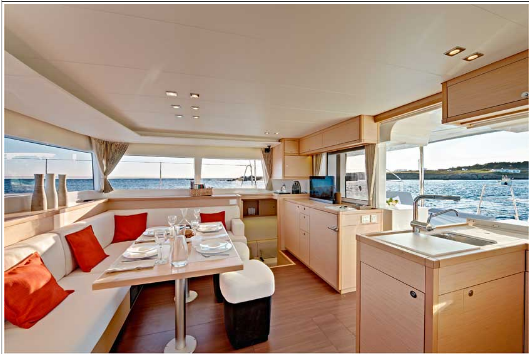
Lagoon 450