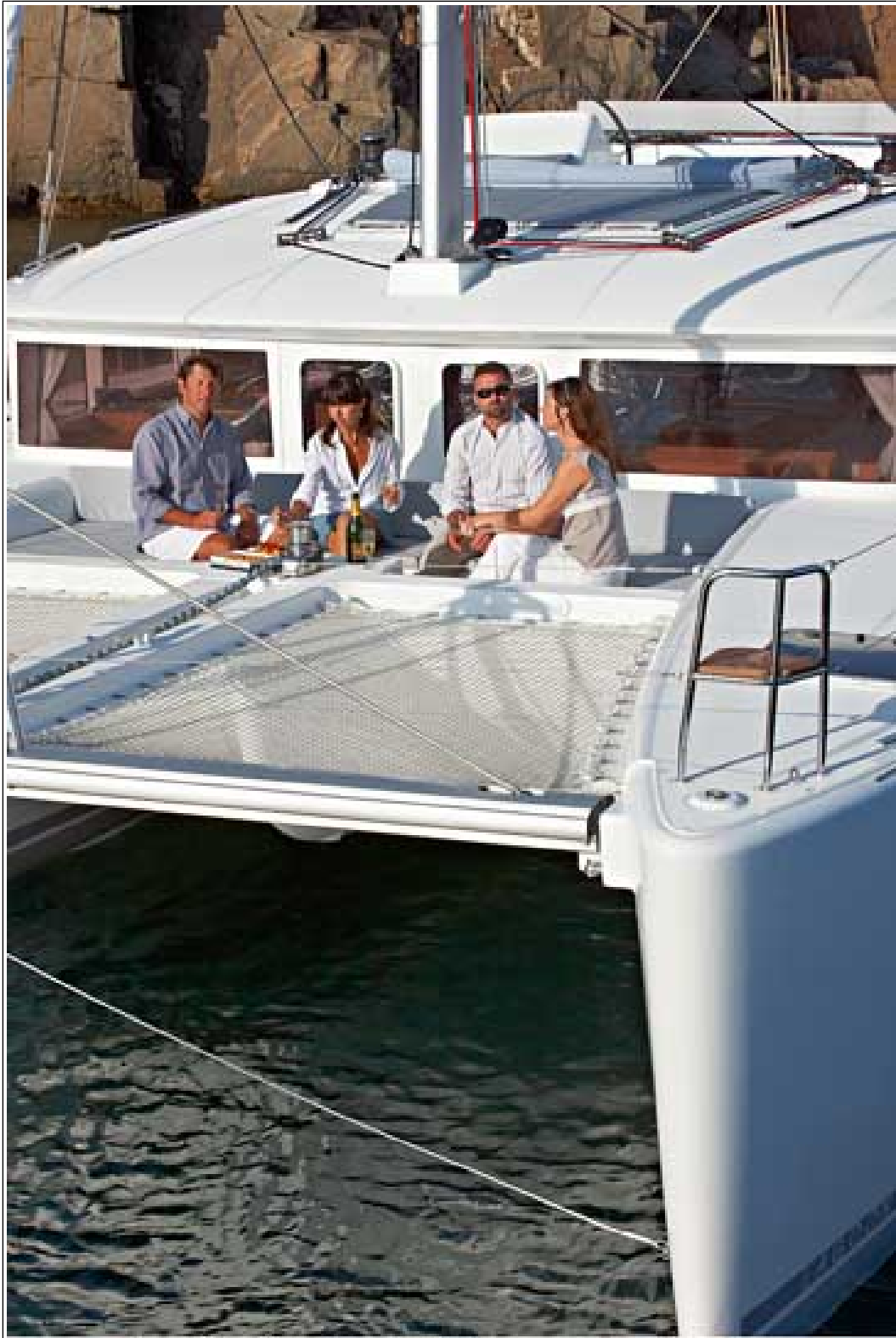
Lagoon 450