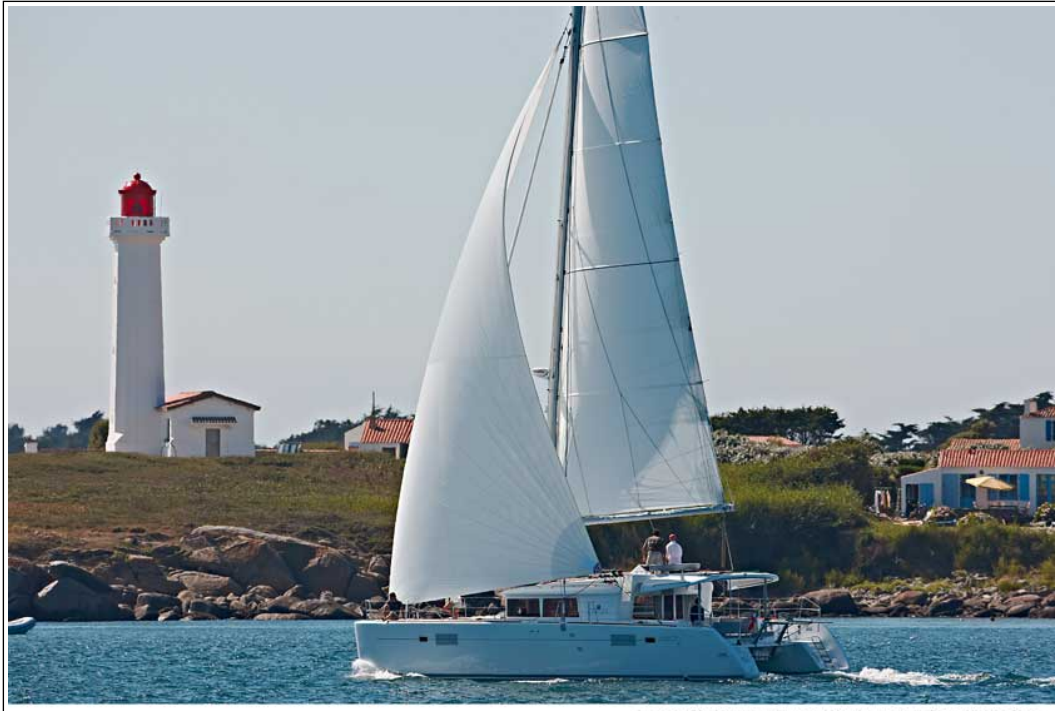
Lagoon 450 - Mention obligatoire / Mandatory credit: Photo Nicolas Claris