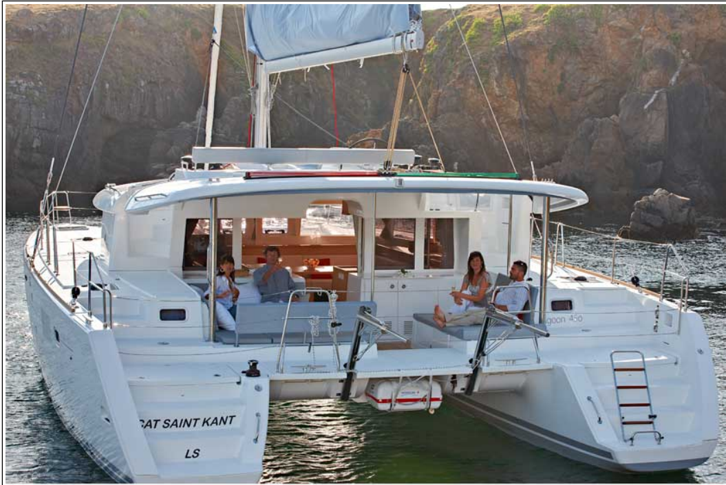
Lagoon 450