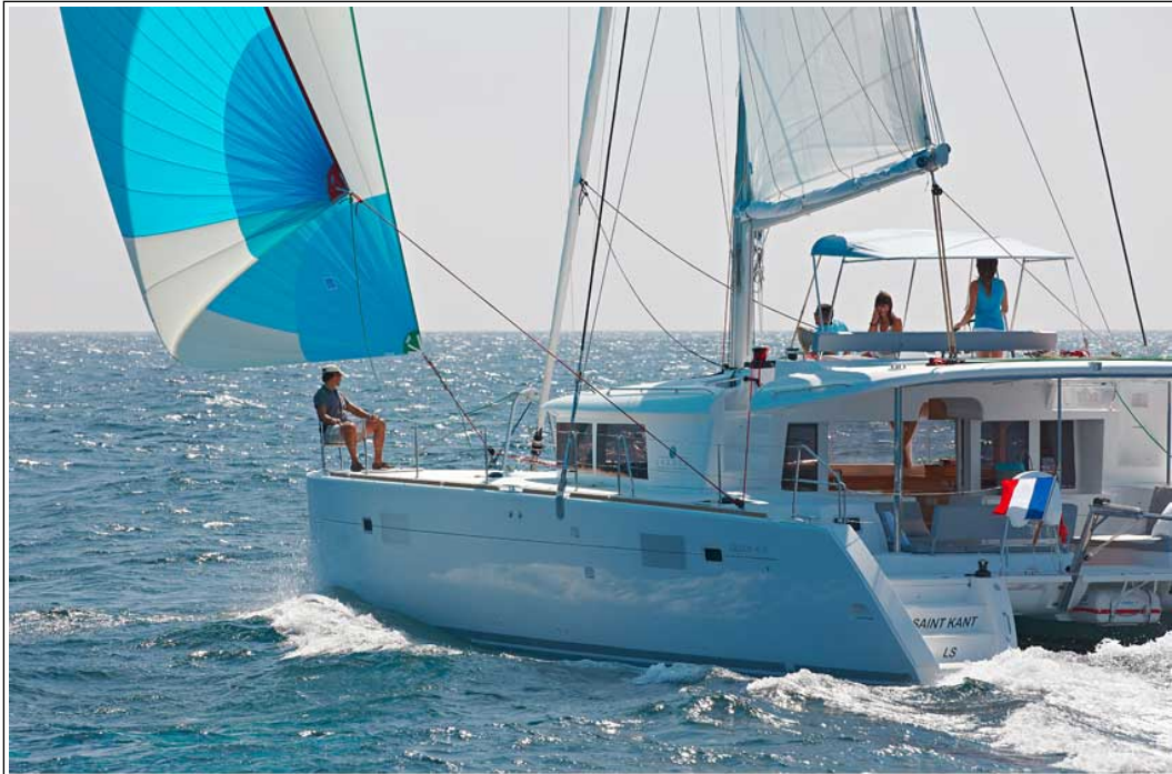
Lagoon 450