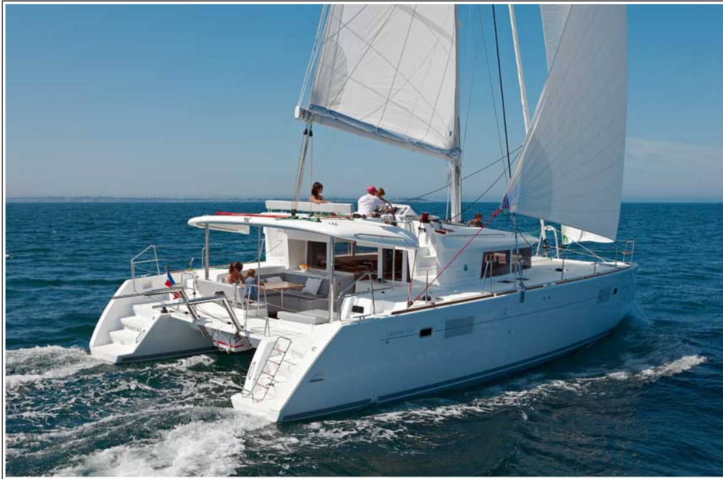
Lagoon 450