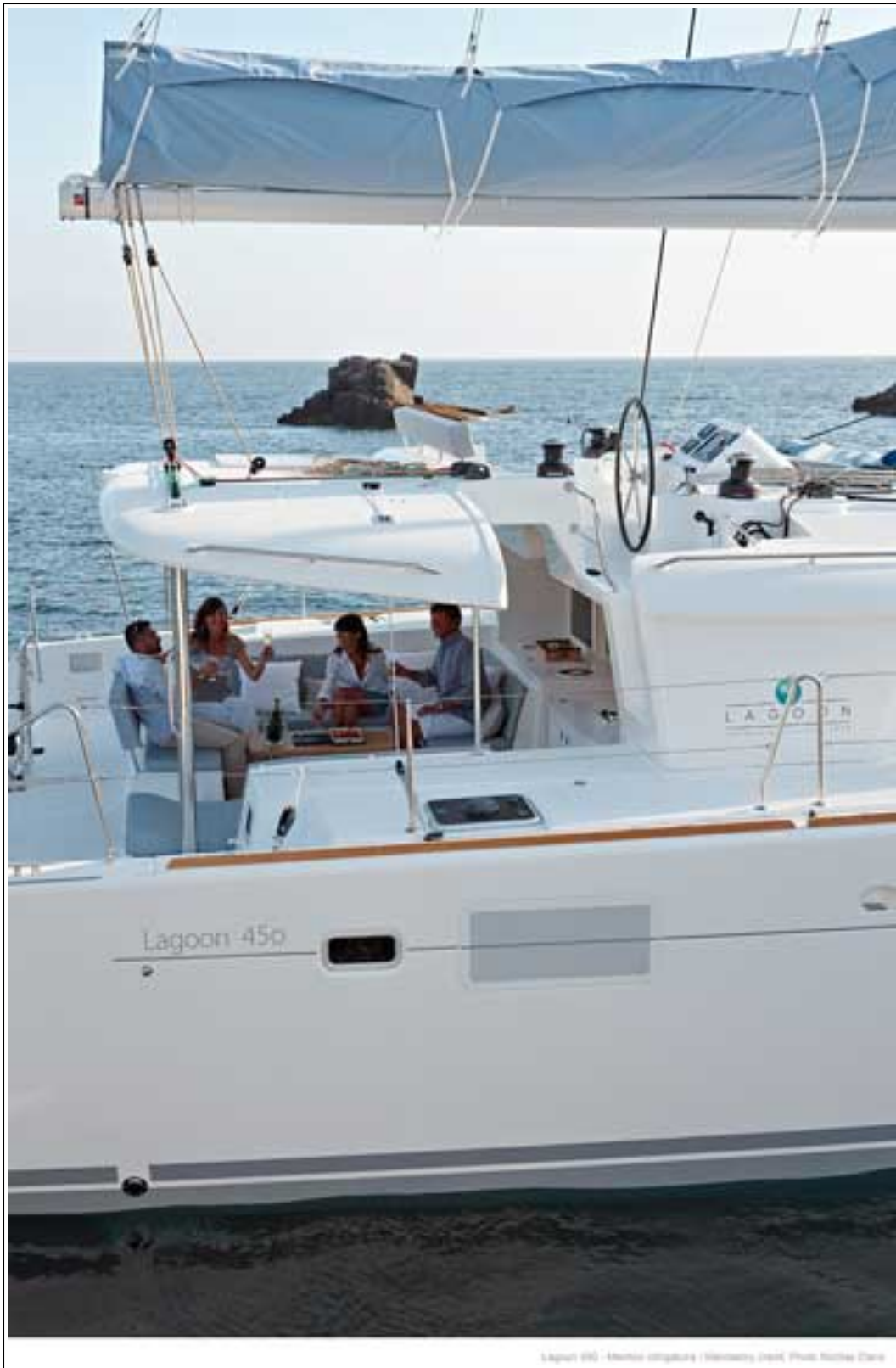
Lagoon 450 - Motor yachts / Motor yachts