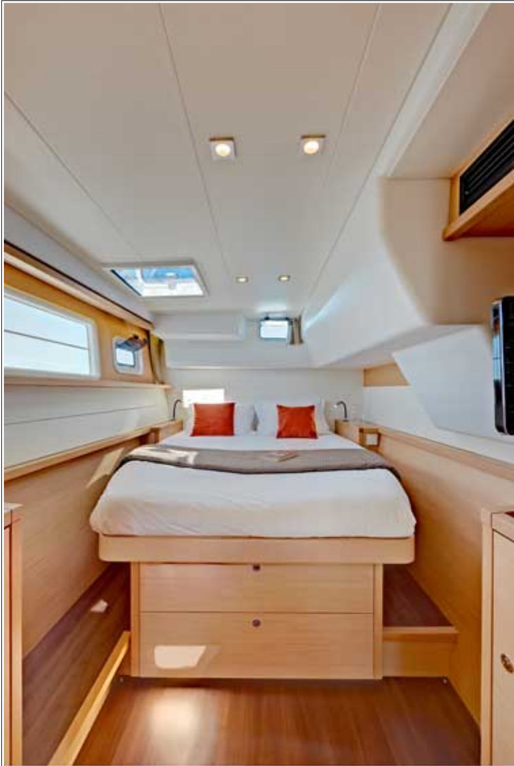
Lignori 490 - Merino ciliegione - Venezia 1988