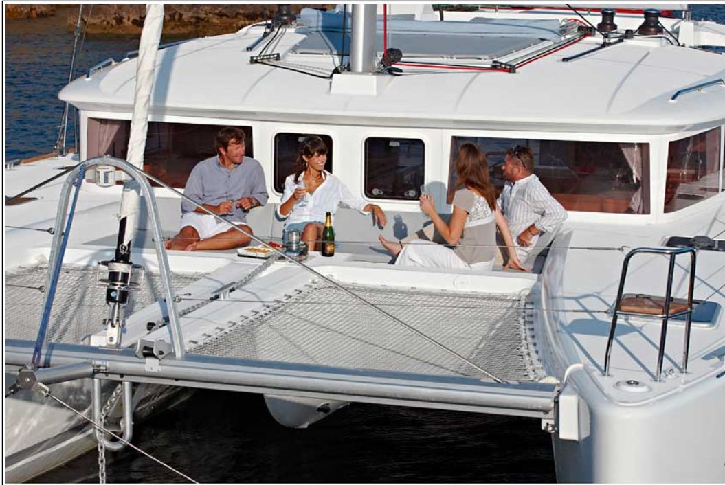
Lagoon 450 - Mention obligatoire / Mandatory credit: Photo Nicolas Claris