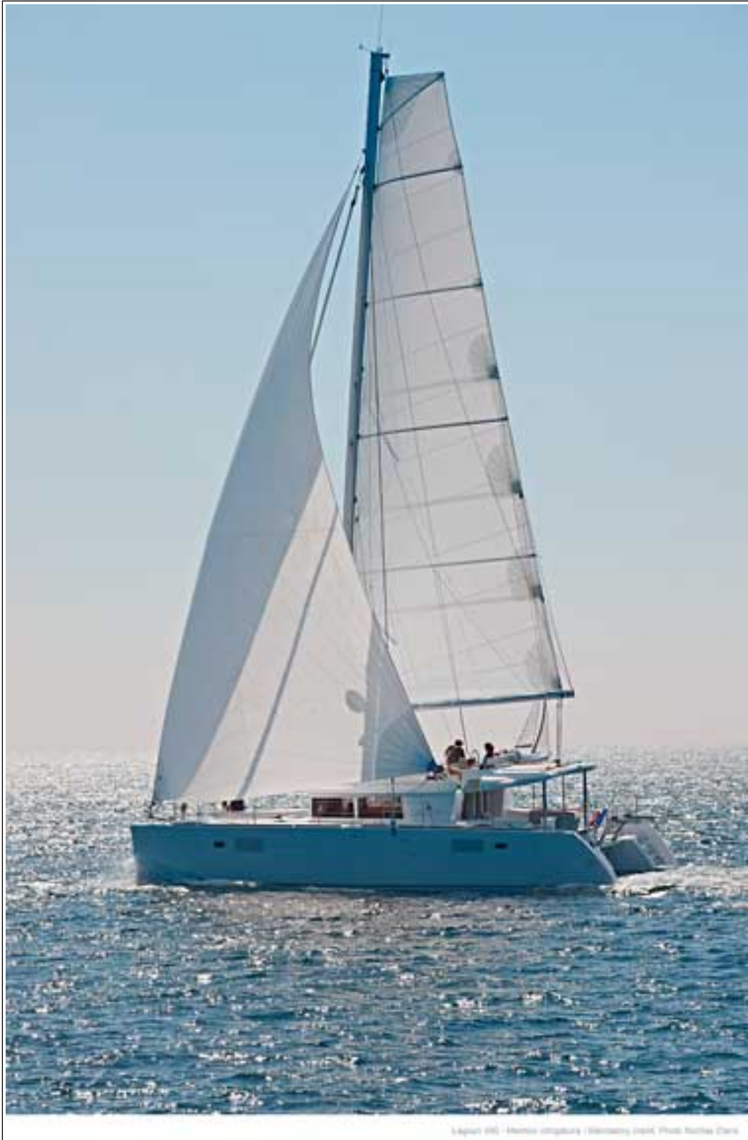
Sloop 495 - Herms-Atguburg / Wismar-Seeck