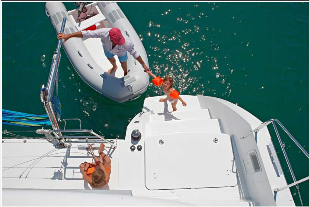
Lagoon 450