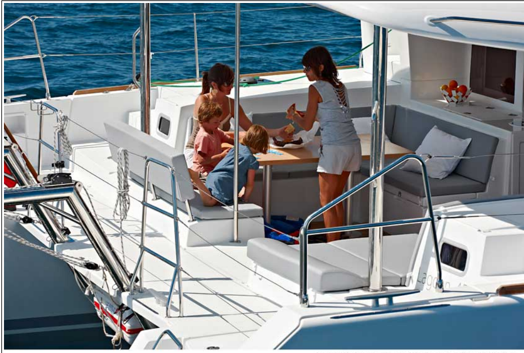
Lagoon 450