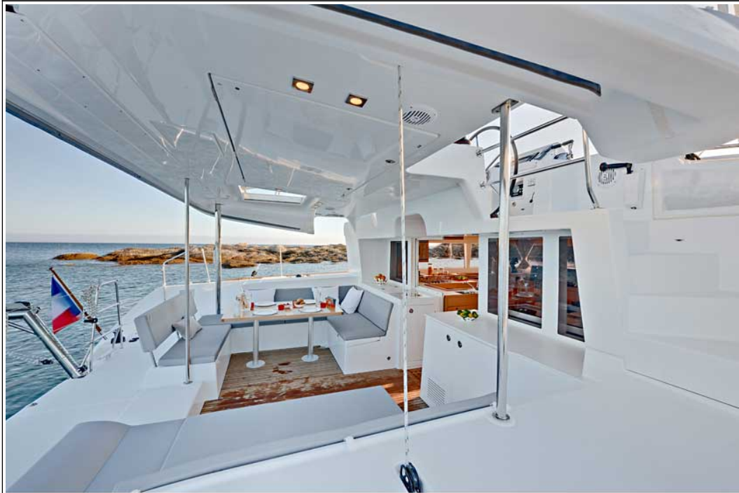
Lagoon 450