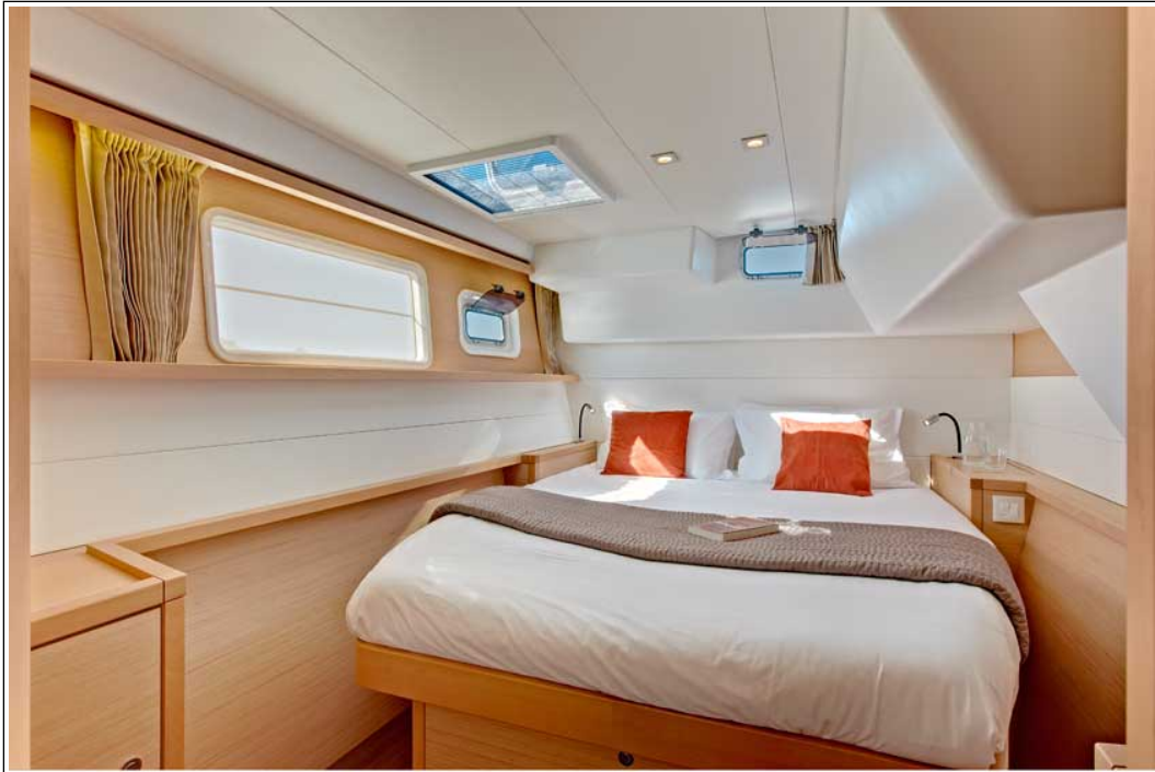
Lagoon 450