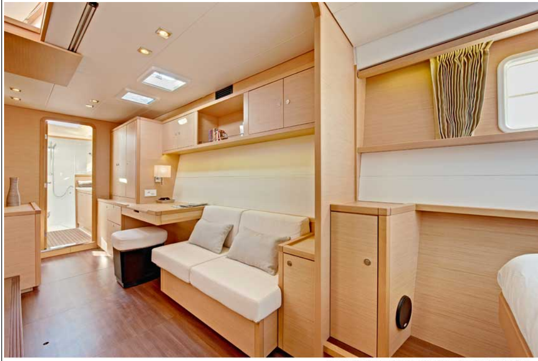
Lagoon 450 - Mention obligatoire / Mandatory credit: Photo Nicolas Claris