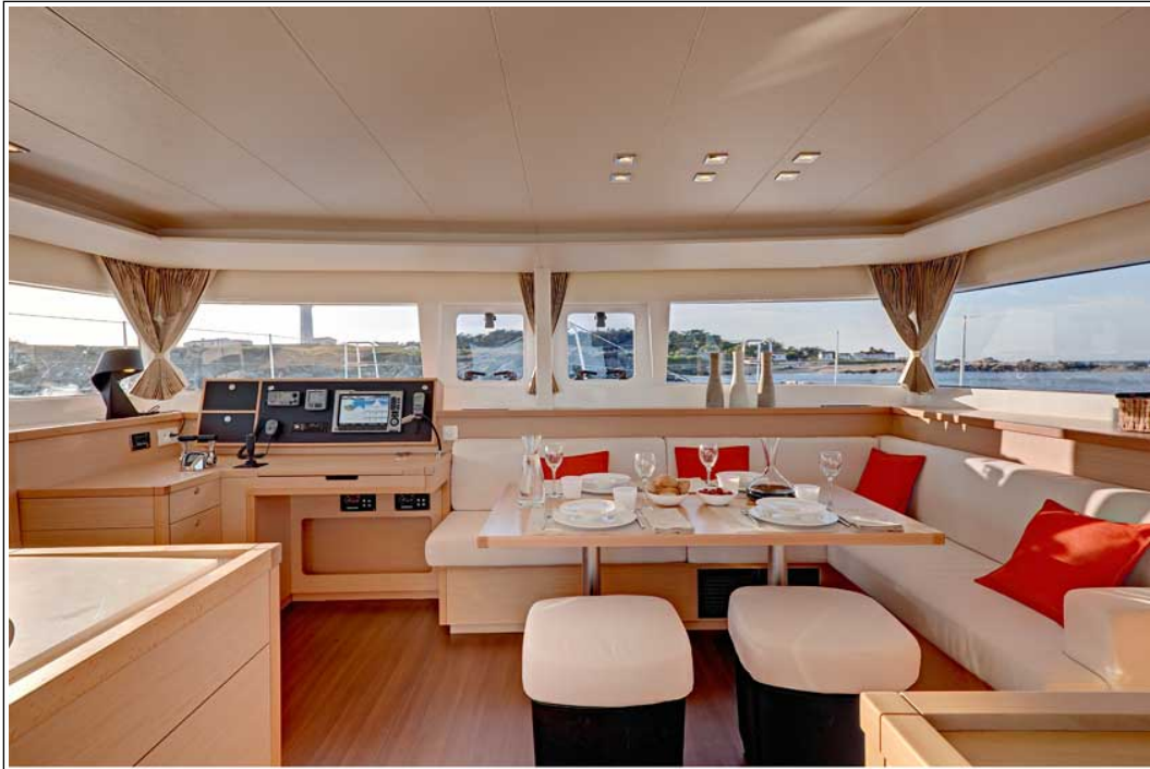
Lagoon 450