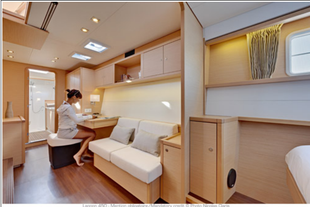
Lagoon 450 - Mention obligatoire/Mandatory credit © Photo Nicolas Claris