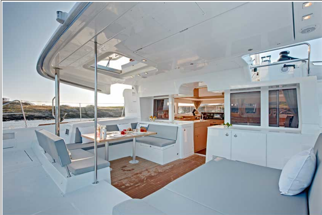
Lagoon 450