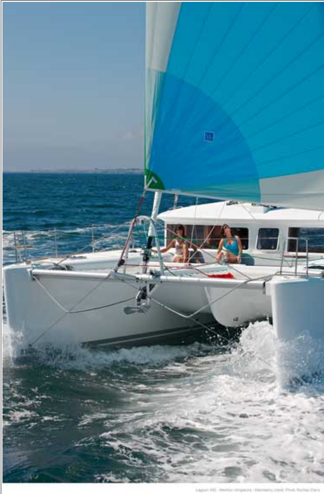
Lagoon 650 - Merina catamaran / Venezia boat