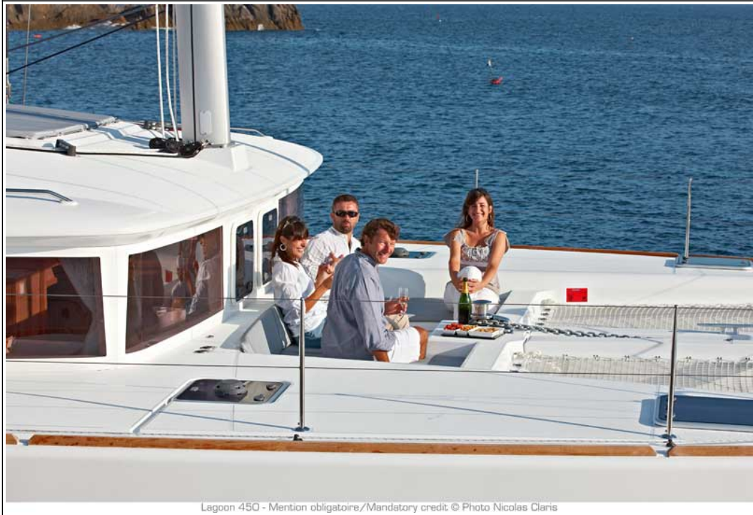
Lagoon 450