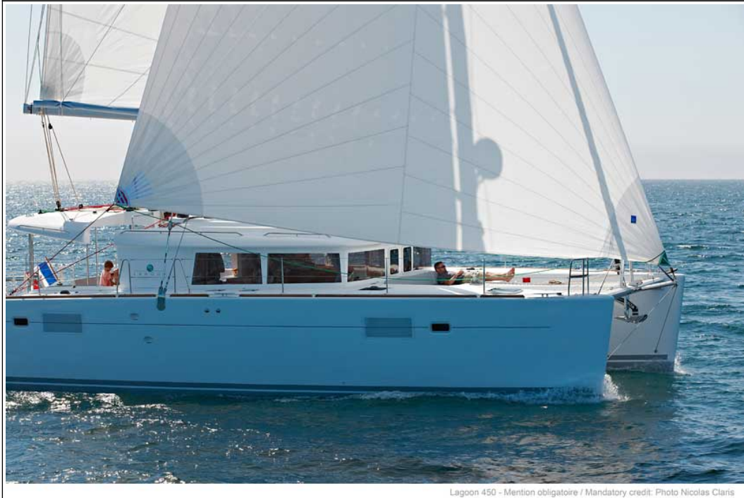
Lagoon 450