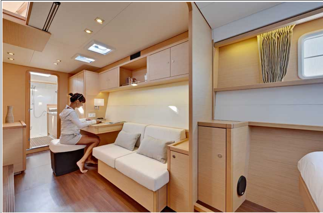
Lagoon 450