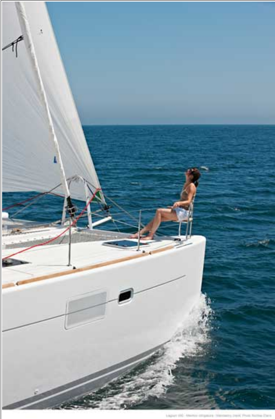
Lagoon 460 - Meritae citipaisa / Wernsley Creek