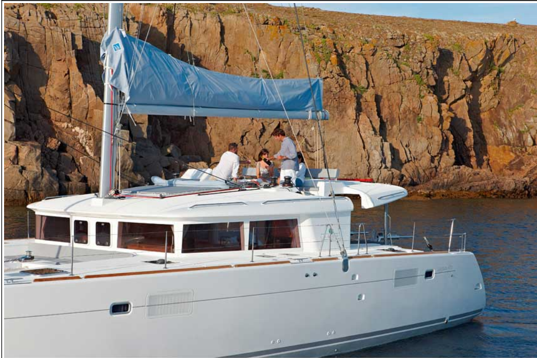
Lagoon 450 - Mention obligatoire / Mandatory credit: Photo Nicolas Claris