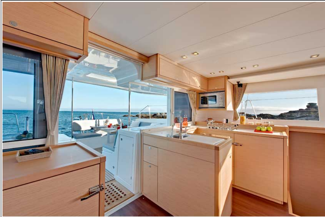
Lagoon 450