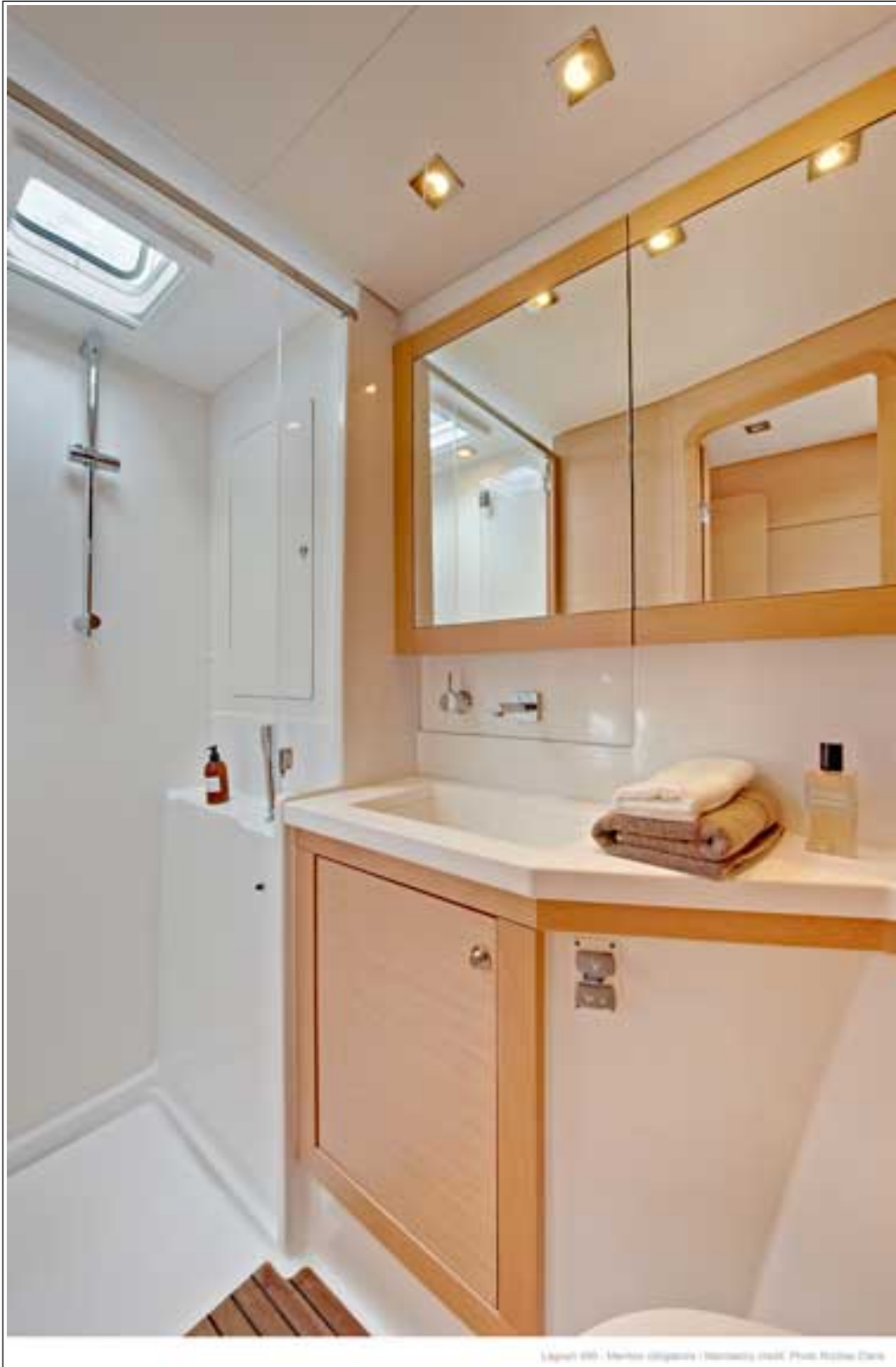
Lignori 490 - Merino ciliegio - Strascina 1900