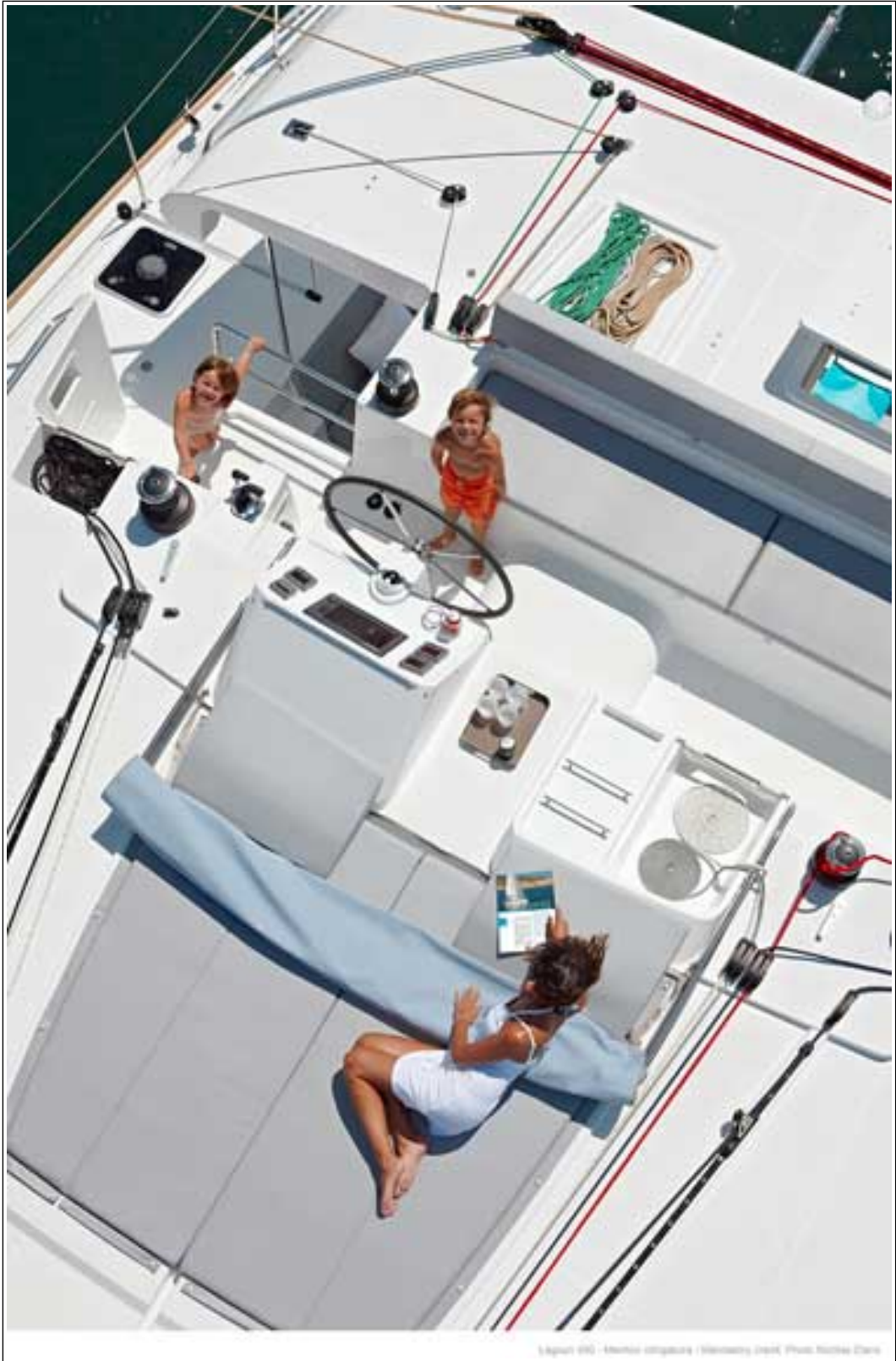
Lagoon 460 - Motor yachts / Motorboats