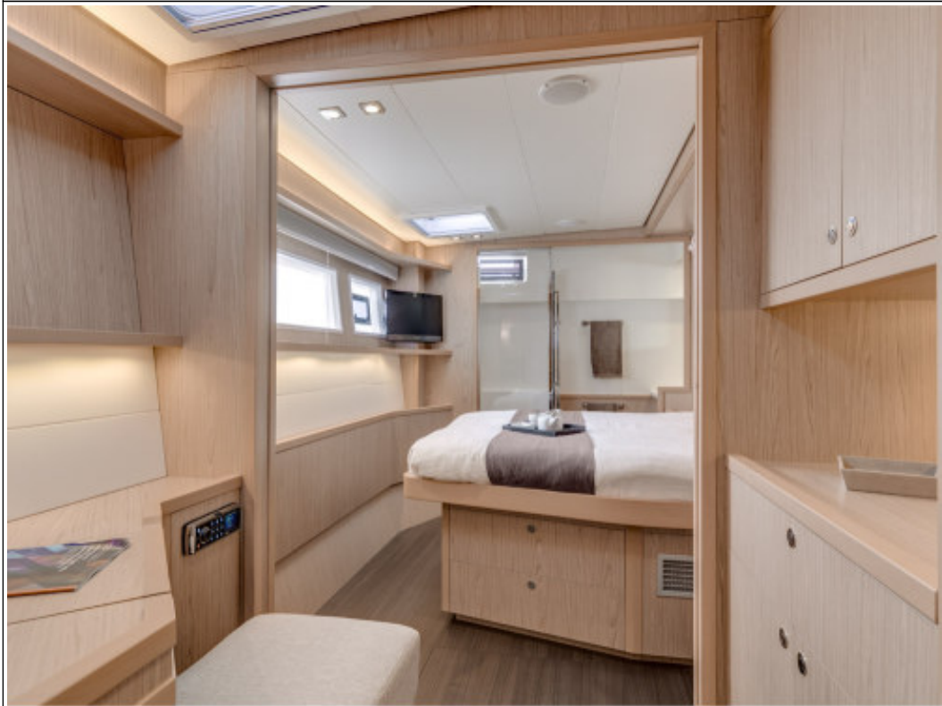
Lagoon 52 - 23/10/2012