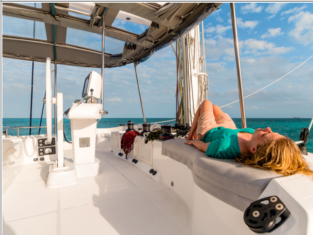
Lagoon 52 - Février 2013