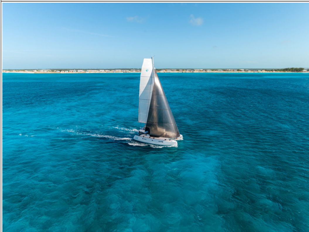
Lagoon 52 - Février 2013