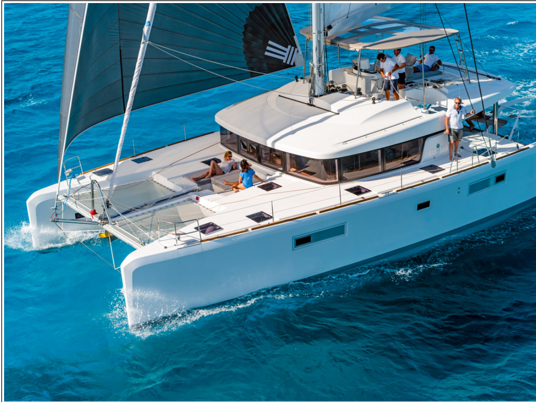
Lagoon 52 - Février 2013 - Mention obligatoire/Mandatory credit: Photo Nicolas Clais