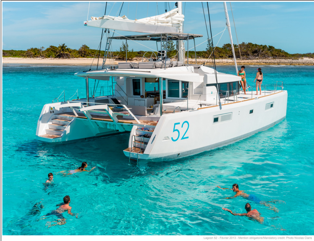
Lagoon 52 - Février 2013