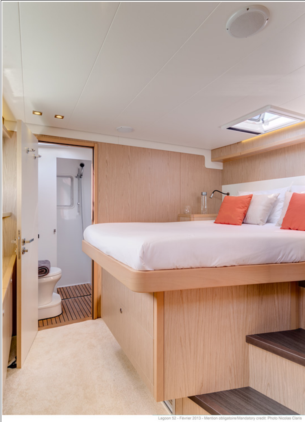
Lagoon 52 - Février 2013