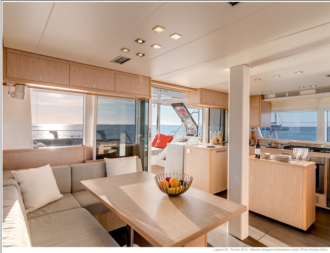
Lagoon 52 - Février 2013