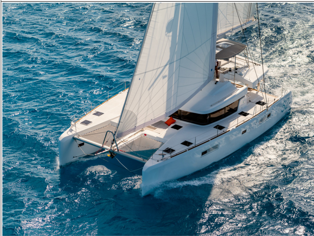
Lagoon 52 - Février 2013 - Mention obligatoire/Mandatory credit: Photo Nicolas Clais