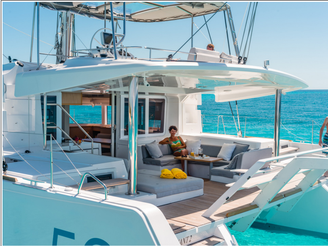
Legon 52 - Février 2013