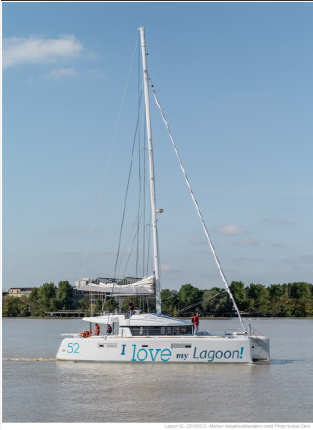
Lagoon 52 - 23/10/2012