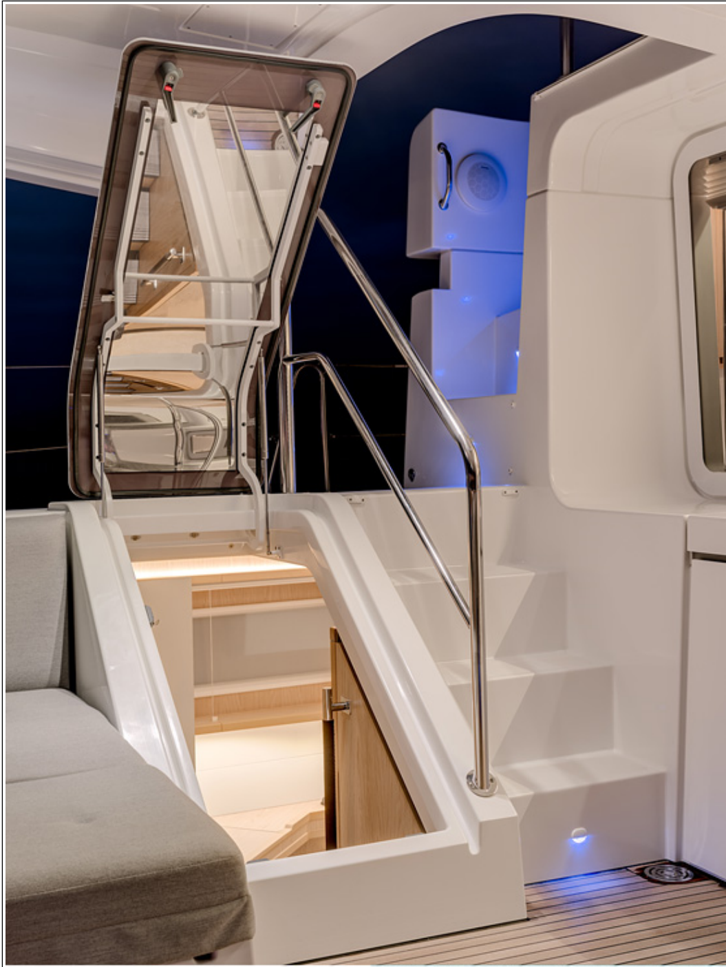
Lagoon 52 - Février 2013