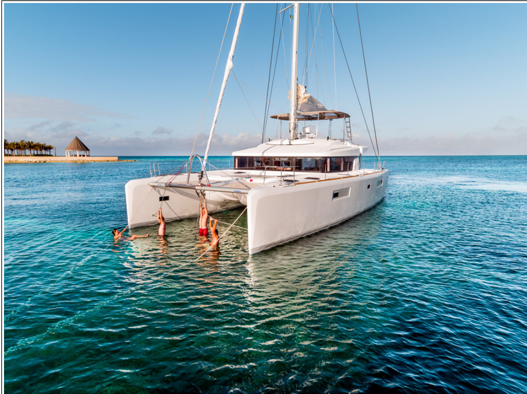
Lagoon 52 - Février 2013 - Mention obligatoire/Mandatory credit: Photo Nicolas Claris