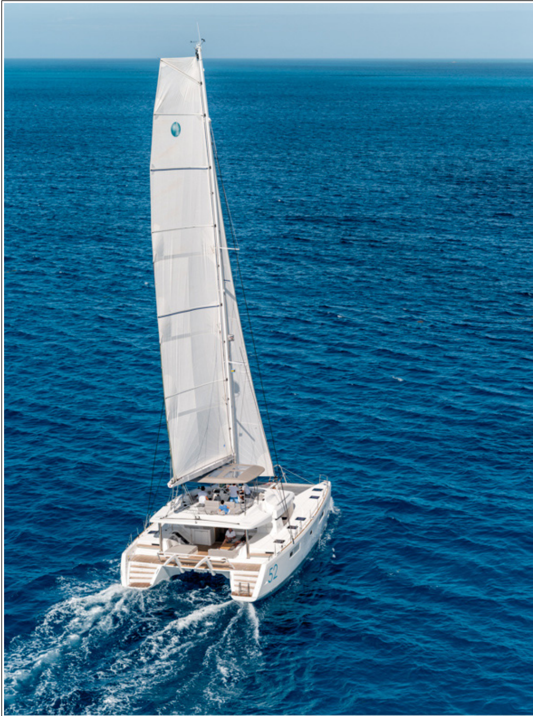
Lagoon 52 - Février 2013 - Mention obligatoire/Mandatory credit: Photo Nicolas Claris