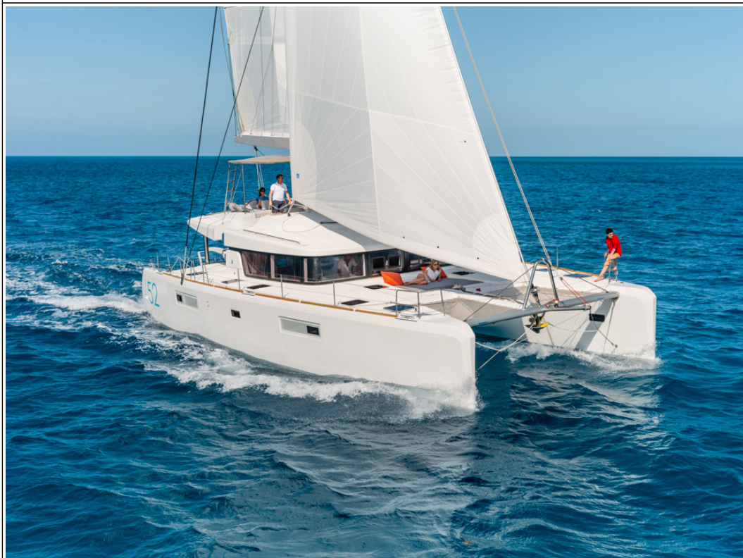
Lagoon 52 - Février 2013 - Mention obligatoire/Mandatory credit: Photo Nicolas Claris