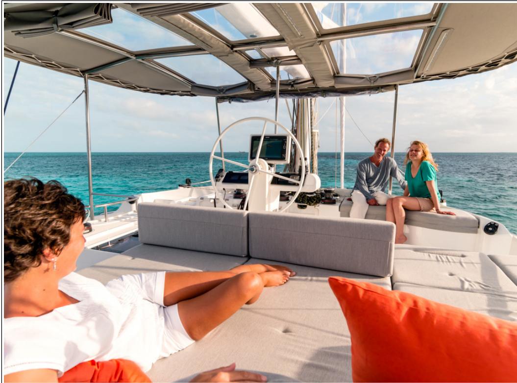
Lagoon 52 - Février 2013 - Mention obligatoire/Mandatory credit: Photo Nicolas Claris