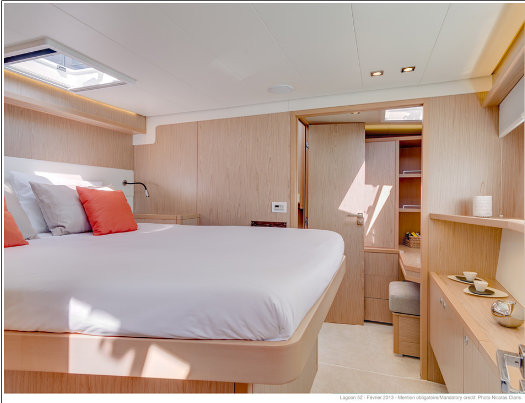
Lagoon 52 - Février 2013 - Mention obligatoire/Mandatory credit: Photo Nicolas Clais