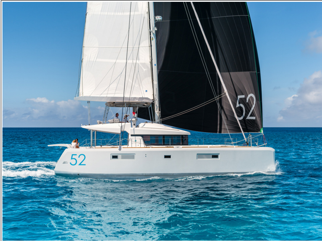
Lagoon 52 - Février 2013 - Mention obligatoire/Mandatory credit: Photo Nicolas Clais