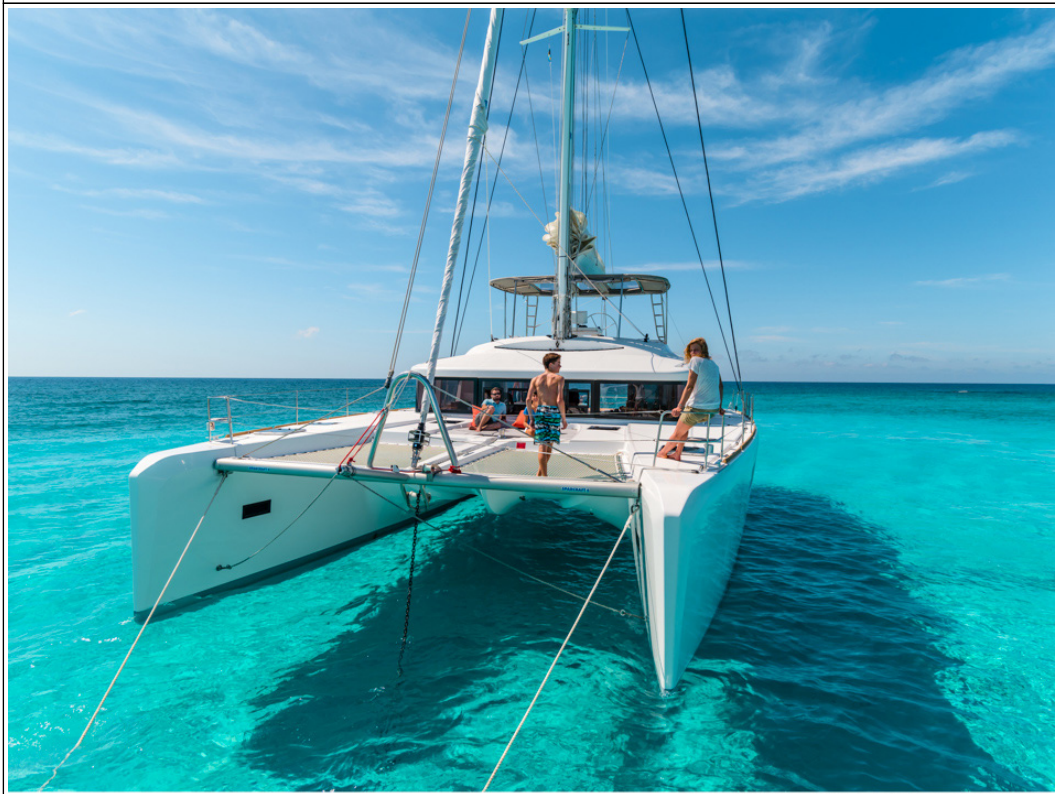
Lagoon 52 - Février 2013 - Mention obligatoire/Mandatory credit: Photo Nicolas Claris