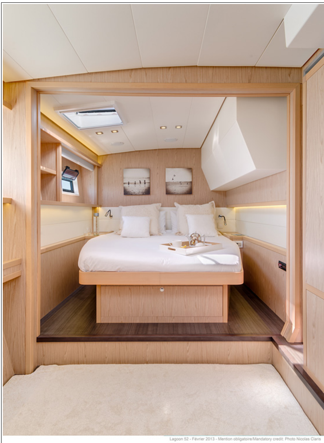
Lagoon 52 - Février 2013