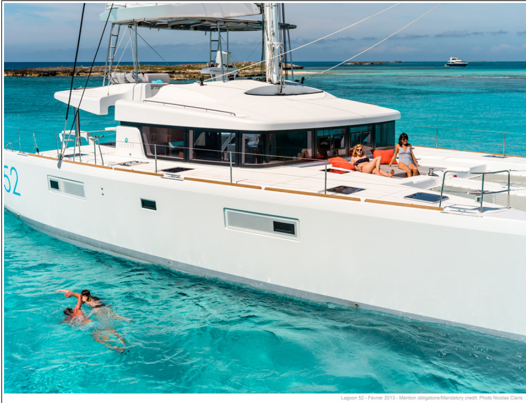
Lagoon 52 - Février 2013 - Mention obligatoire/Mandatory credit. Photo Nicolas Clais