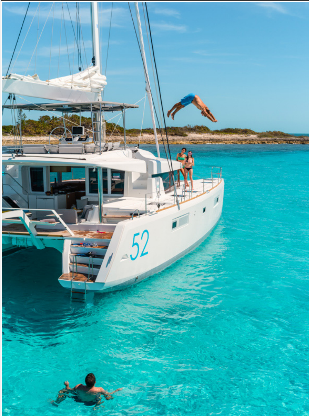
Lagoon 52 - Février 2013 - Mention obligatoire/Mandatory credit: Photo Nicolas Claris