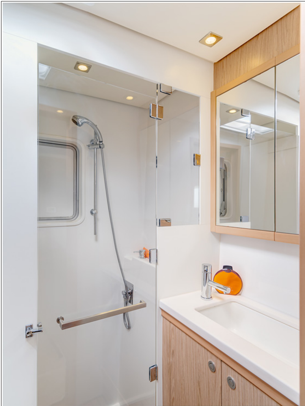
Lagoon 52 - Février 2013