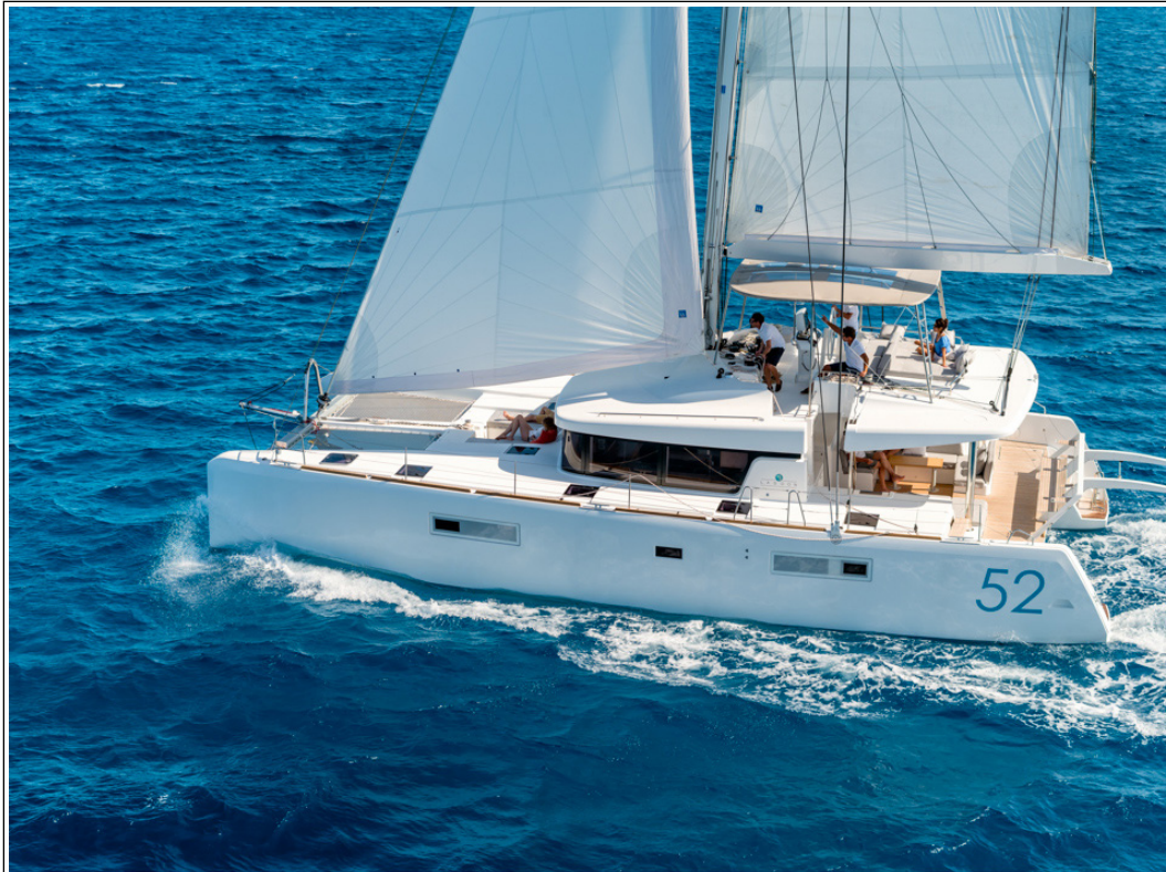
Lagoon 52 - Février 2013 - Mention obligatoire/Mandatory credit: Photo Nicolas Claris