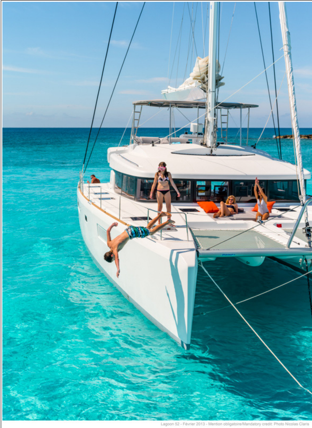
Lagoon 52 - Février 2013