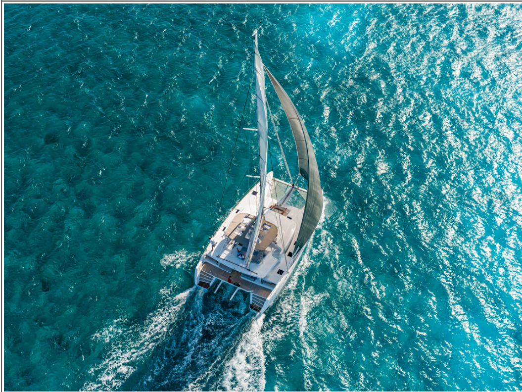
Lagoon 52 - Février 2013 - Mention obligatoire/Mandatory credit: Photo Nicolas Clais