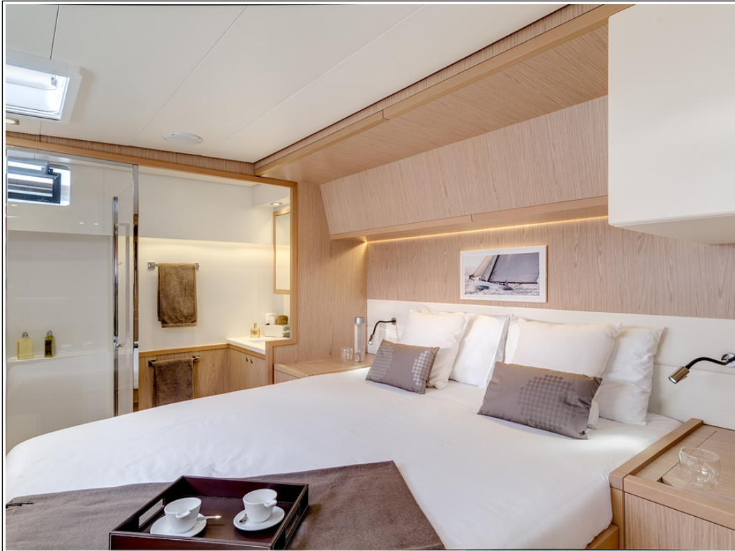
Lagoon 52 - Février 2013 - Mention obligatoire/Mandatory credit: Photo Nicolas Claris