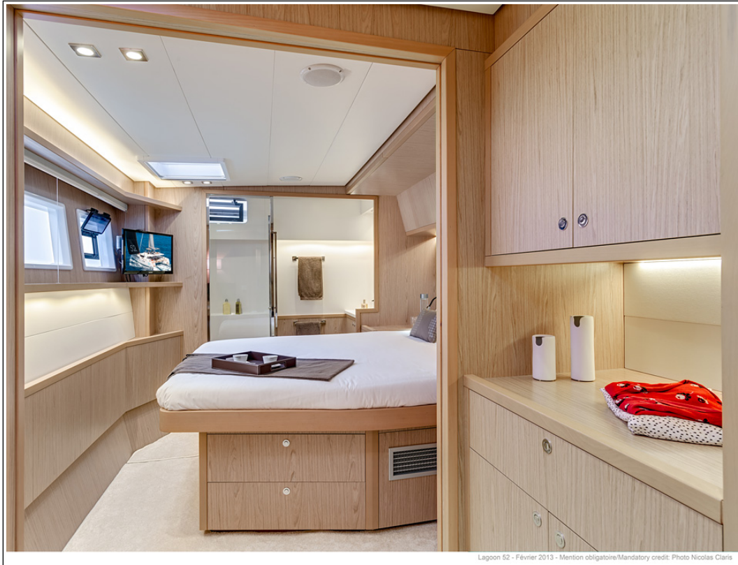
Lagoon 52 - Février 2013 - Mention obligatoire/Mandatory credit: Photo Nicolas Charis