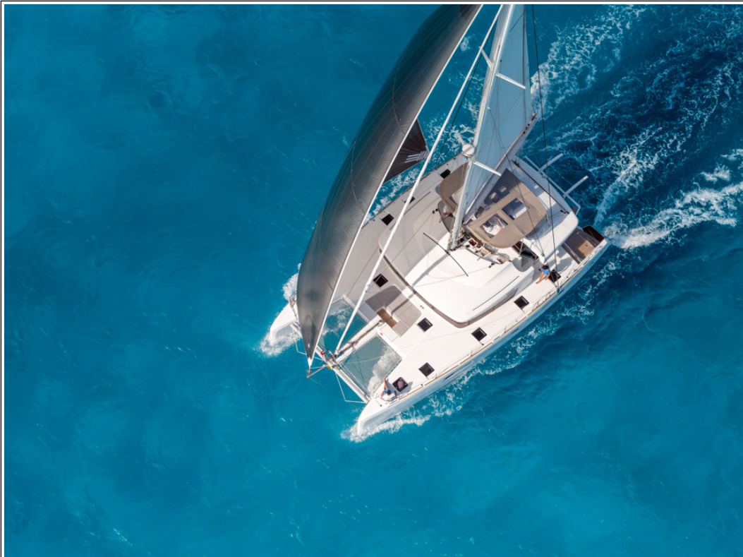
Lagoon 52 - Février 2013 - Mention obligatoire/Mandatory credit: Photo Nicolas Claris Lagoon 52 - Février 2013 - Mention obligatoire/Mandatory credit: Photo Nicolas Claris