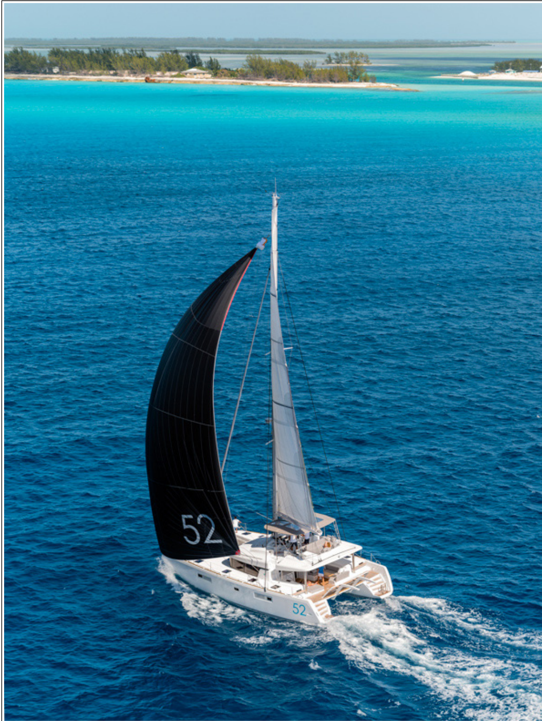
Lagoon 52 - Février 2013 - Mention obligatoire/Mandatory credit: Photo Nicolas Claris