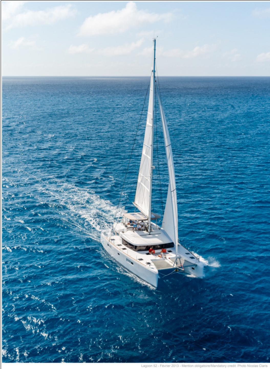
Lagoon 52 - Février 2013 - Mention obligatoire/Mandatory credit: Photo Nicolas Claris