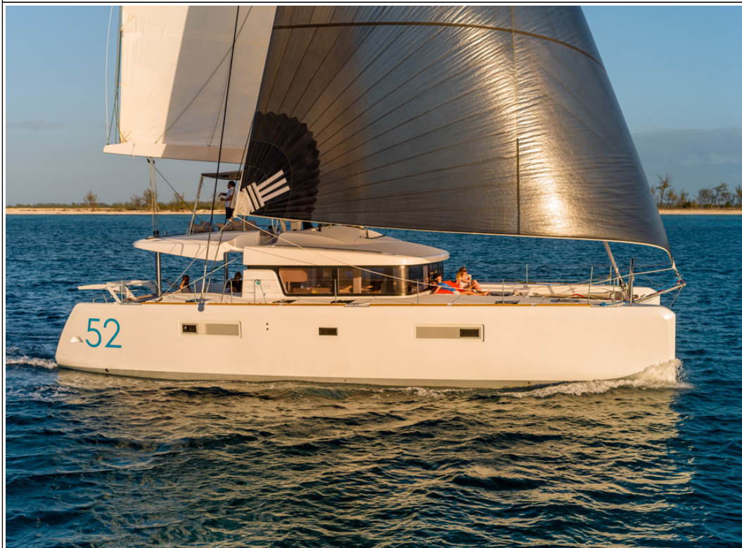
Lagoon 52 - Février 2013 - Mention obligatoire/Mandatory credit: Photo Nicolas Clais