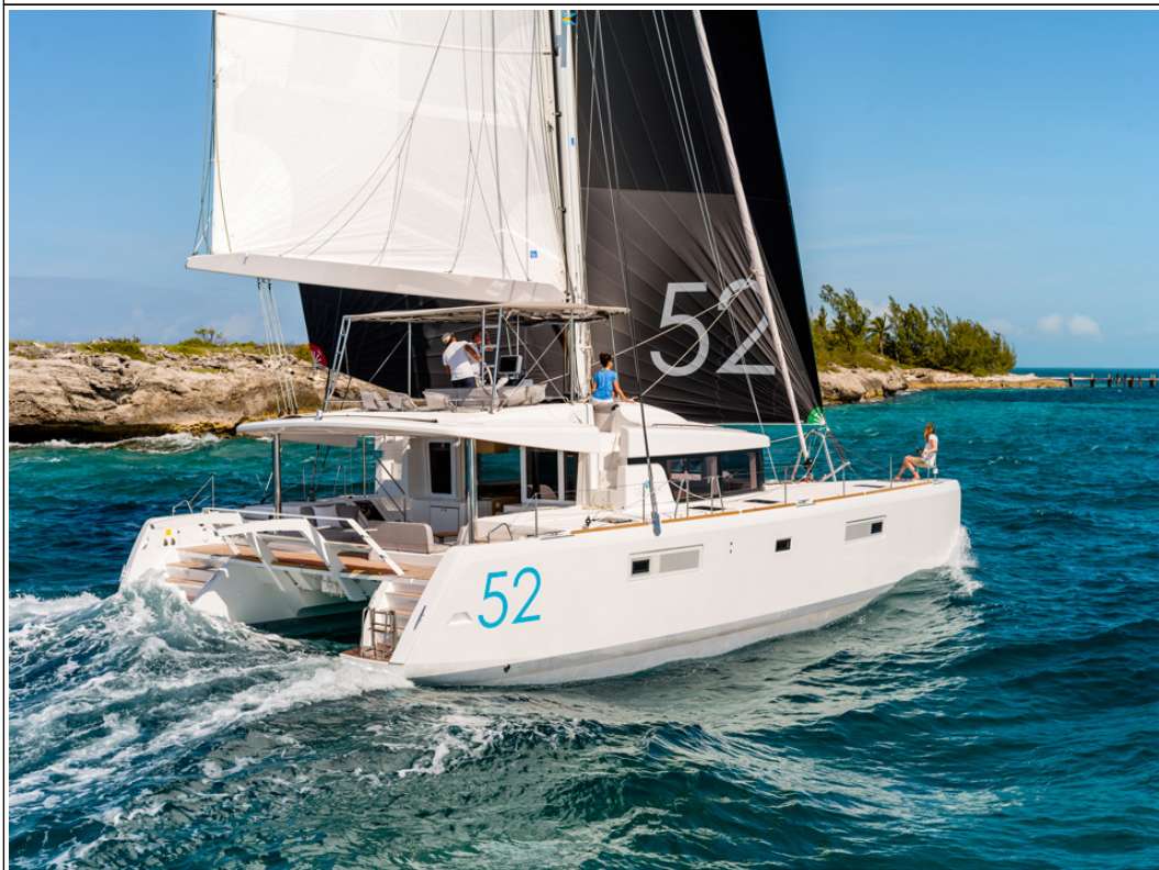
Lagoon 52 - Février 2013 - Mention obligatoire/Mandatory credit: Photo Nicolas Claris