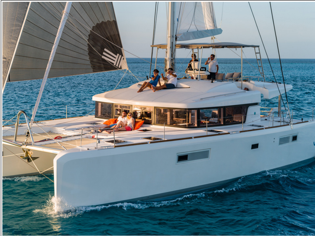
Lagoon 52 - Février 2013 - Mention obligatoire/Mandatory credit: Photo Nicolas Claris