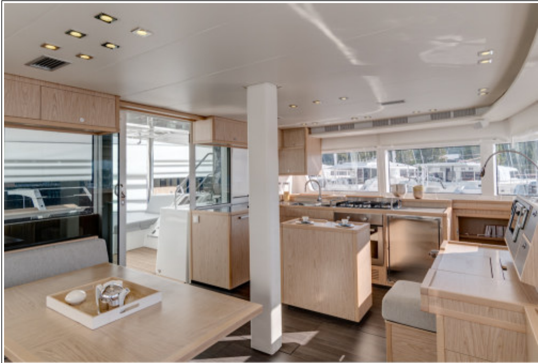
Lagoon 52 - 23/10/2012 - Vention obligatoire/Mandatory credit: Photo Nicolas Clère