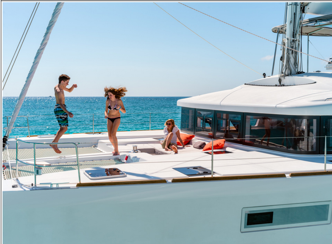
Lagoon 52 - Février 2013 - Mention obligatoire/Mandatory credit: Photo Nicolas Claris