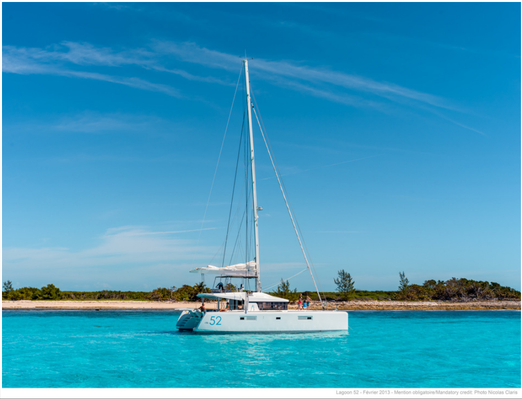
Lagoon 52 - Février 2013 - Mention obligatoire/Mandatory credit. Photo Nicolas Clais