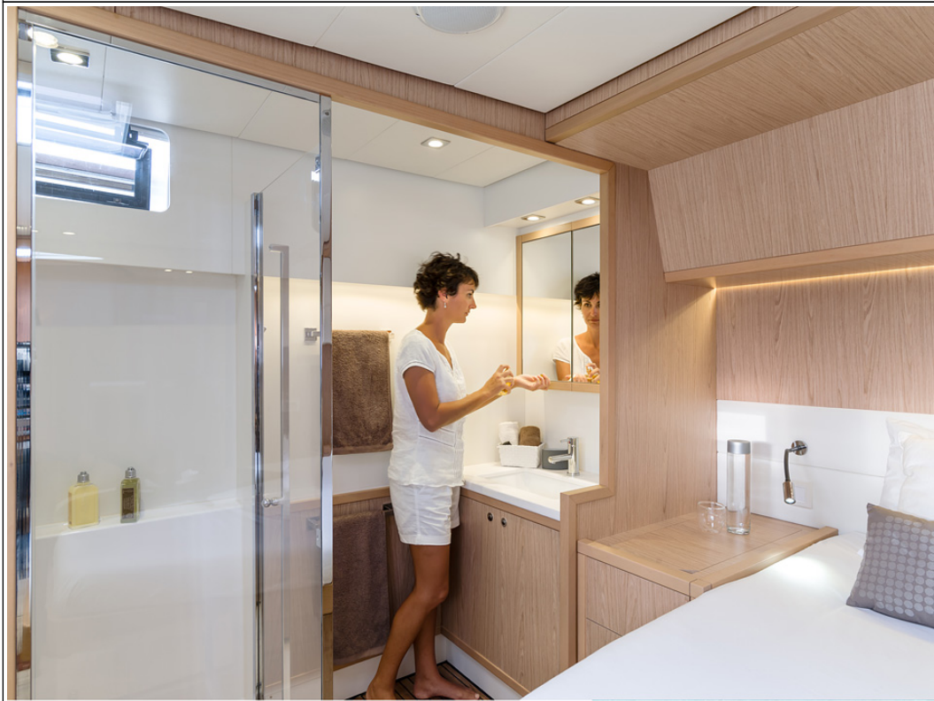
Lagoon 52 - Février 2013