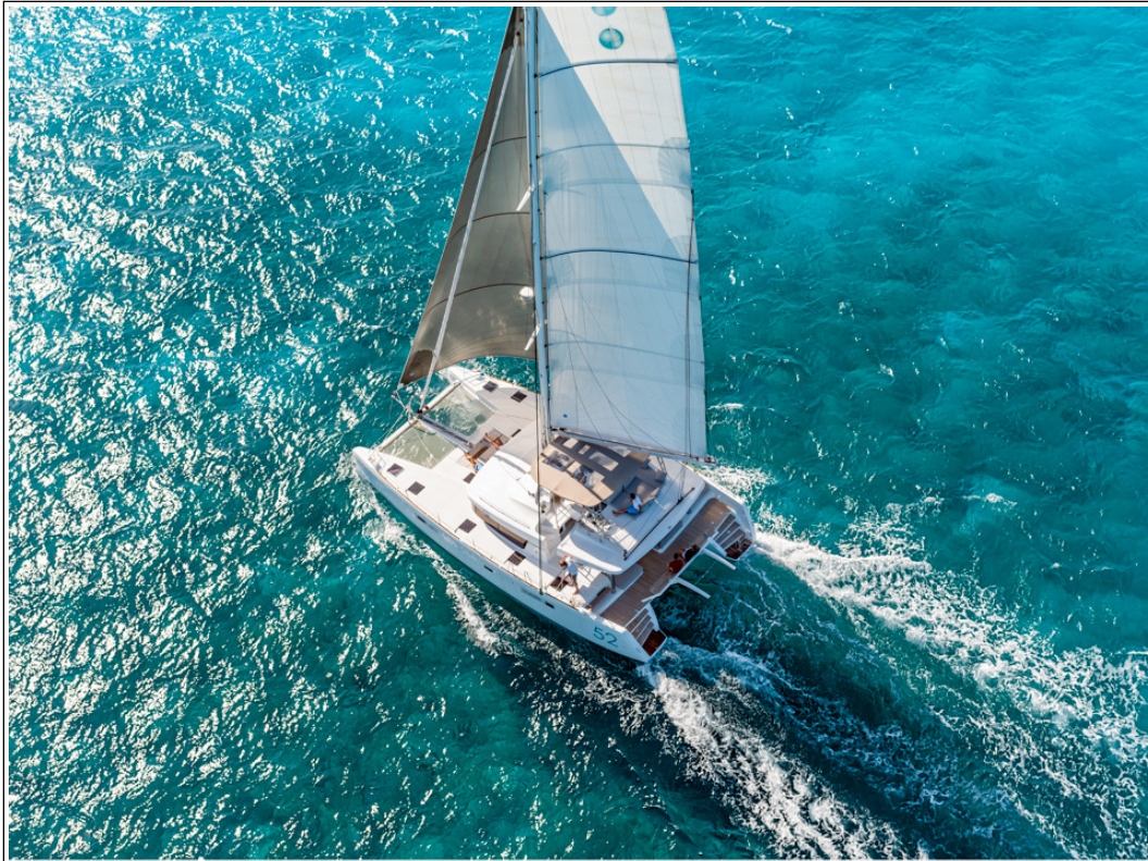
Lagoon 52 - Février 2013 - Mention obligatoire/Mandatory credit: Photo Nicolas Claris