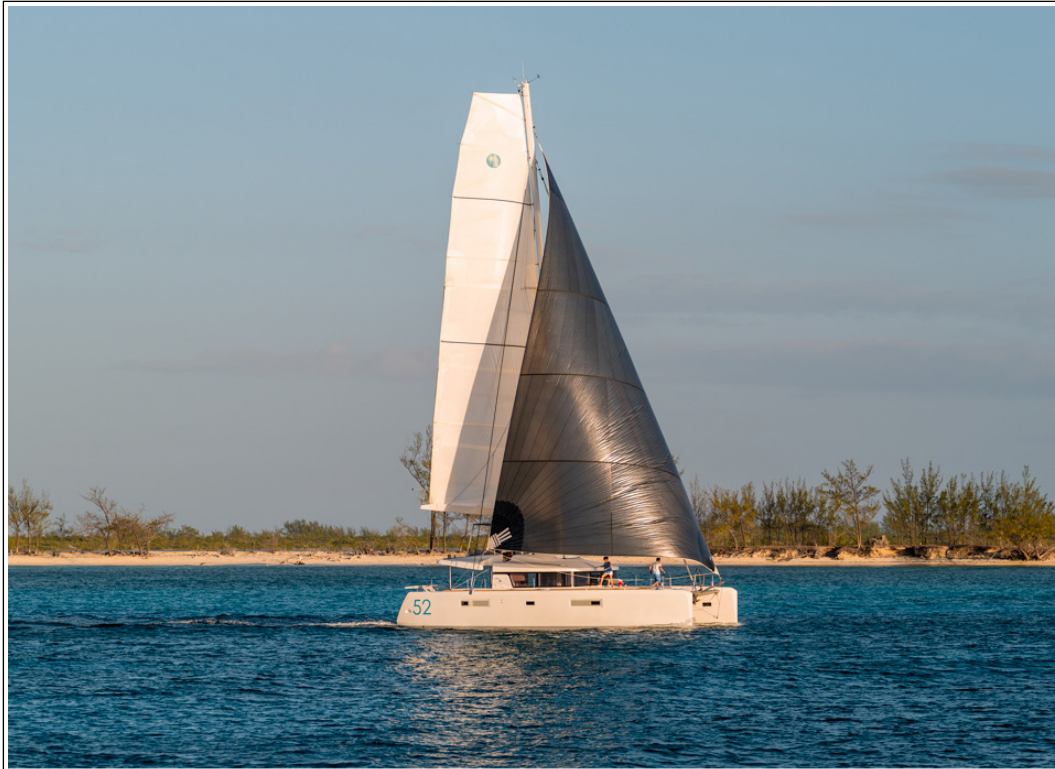
Lagoon 52 - Février 2013 - Mention obligatoire/Mandatory credit: Photo Nicolas Clais