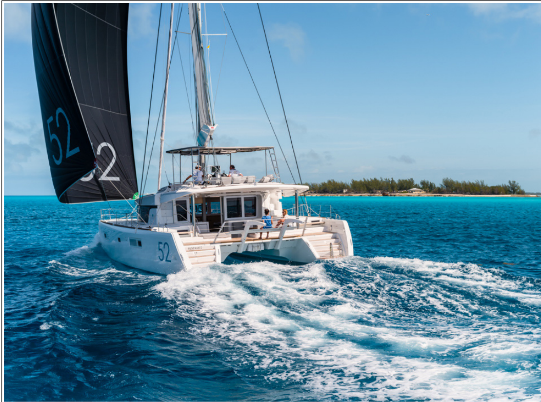
Lagoon 52 - Février 2013 - Mention obligatoire/Mandatory credit: Photo Nicolas Clais