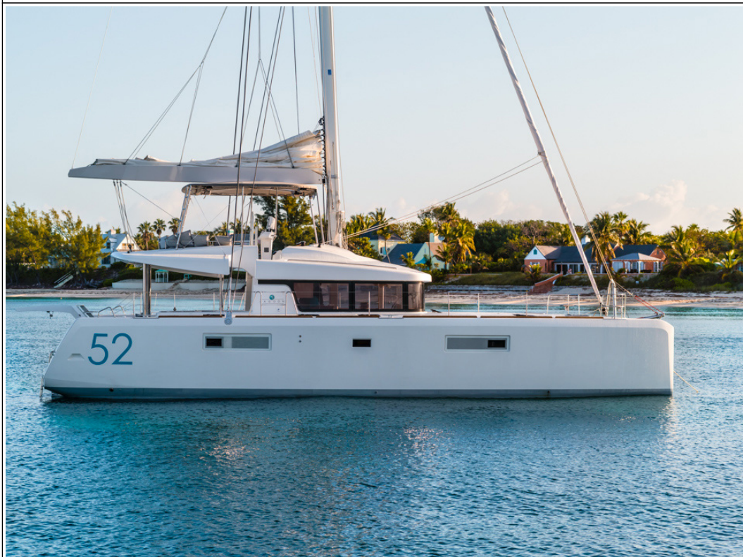
Lagoon 52 - Février 2013 - Mention obligatoire/Mandatory credit: Photo Nicolas Claris