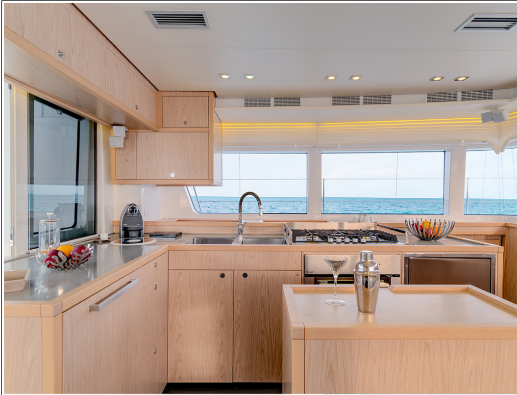
Lagoon 52 - Février 2013 - Mention obligatoire/Mandatory credit: Photo Nicolas Claris