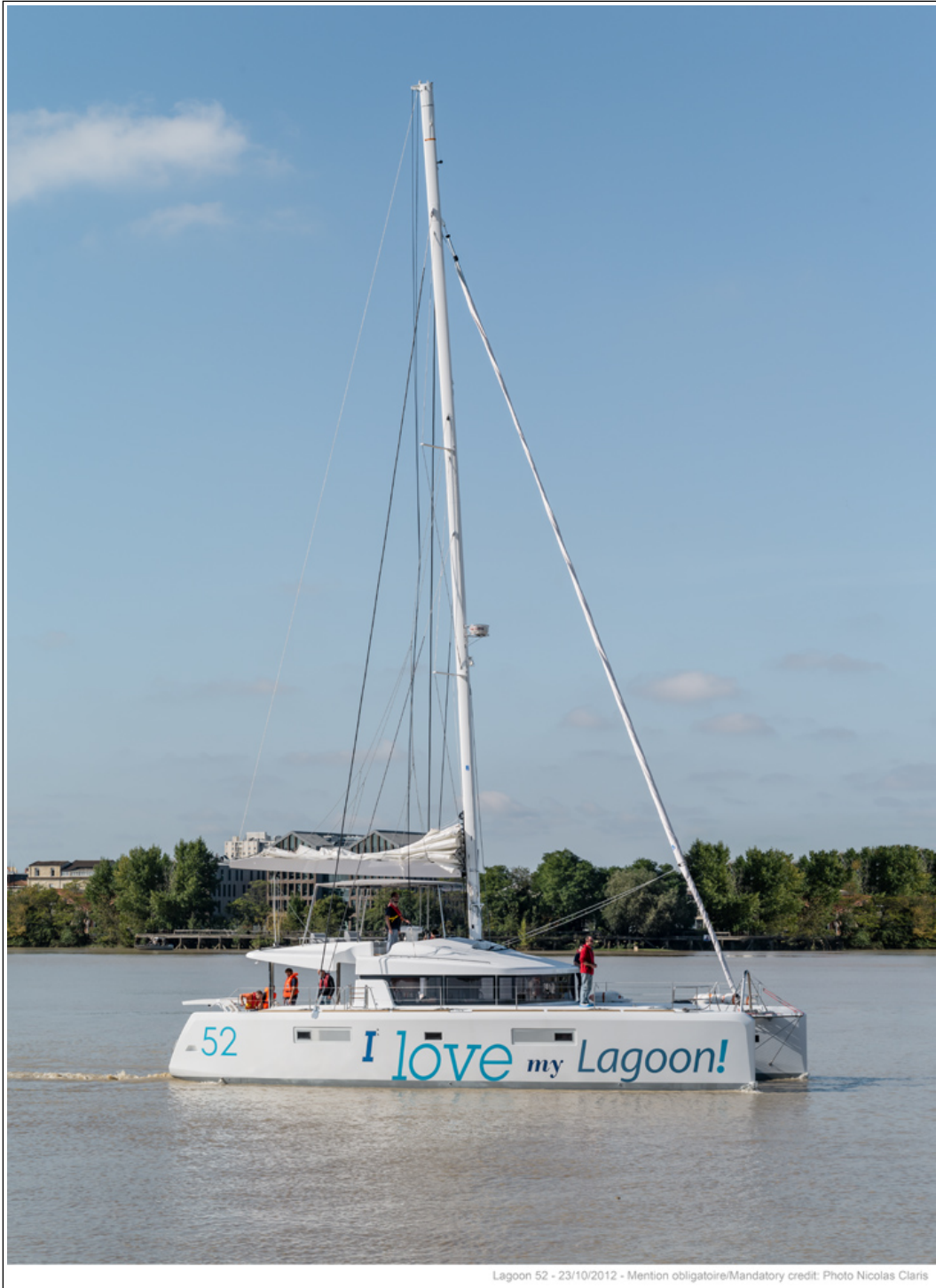
Lagoon 52 - 23/10/2012