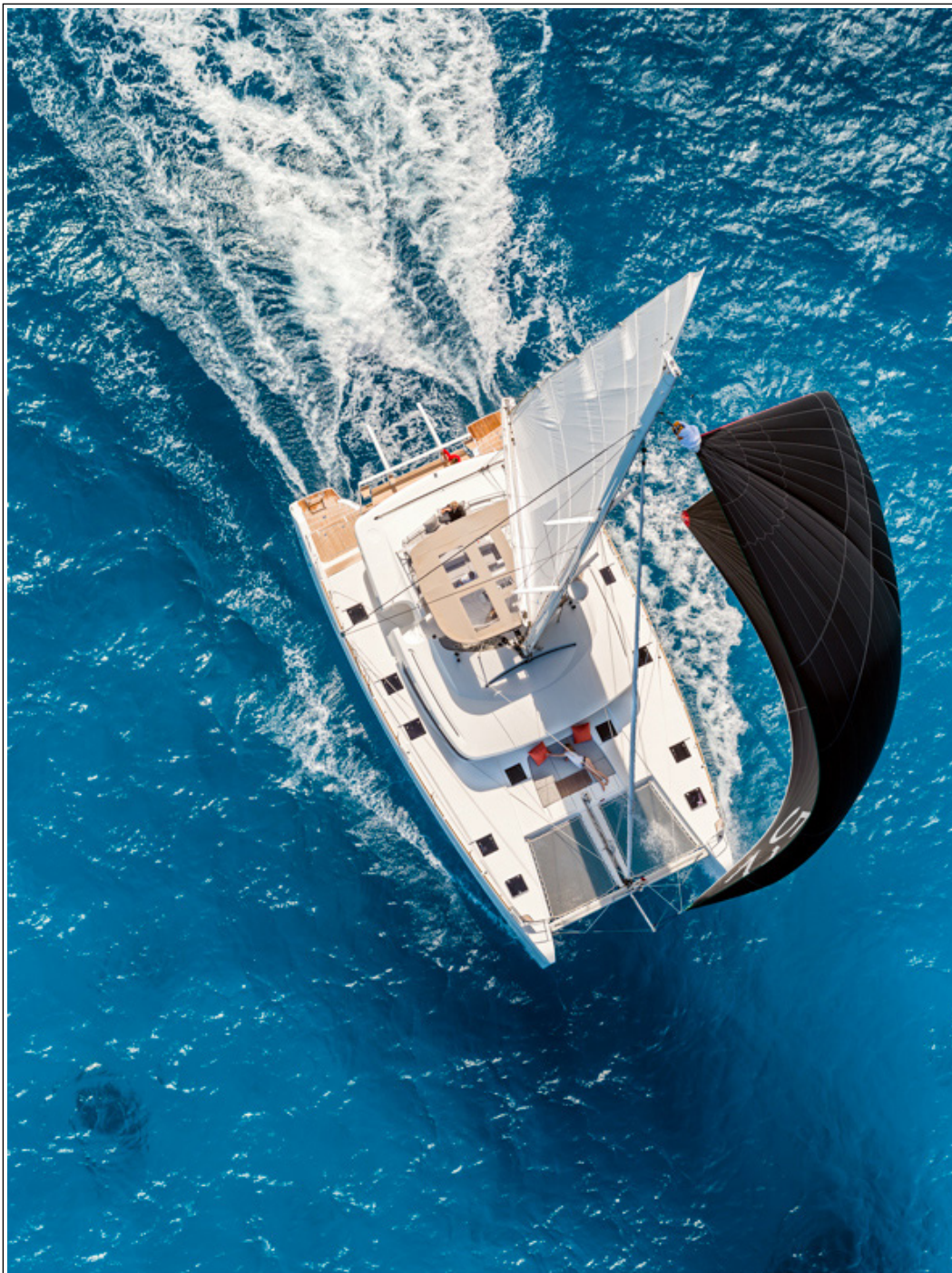
Lagoon 52 - Février 2013 - Mention obligatoire/Mandatory credit: Photo Nicolas Claris