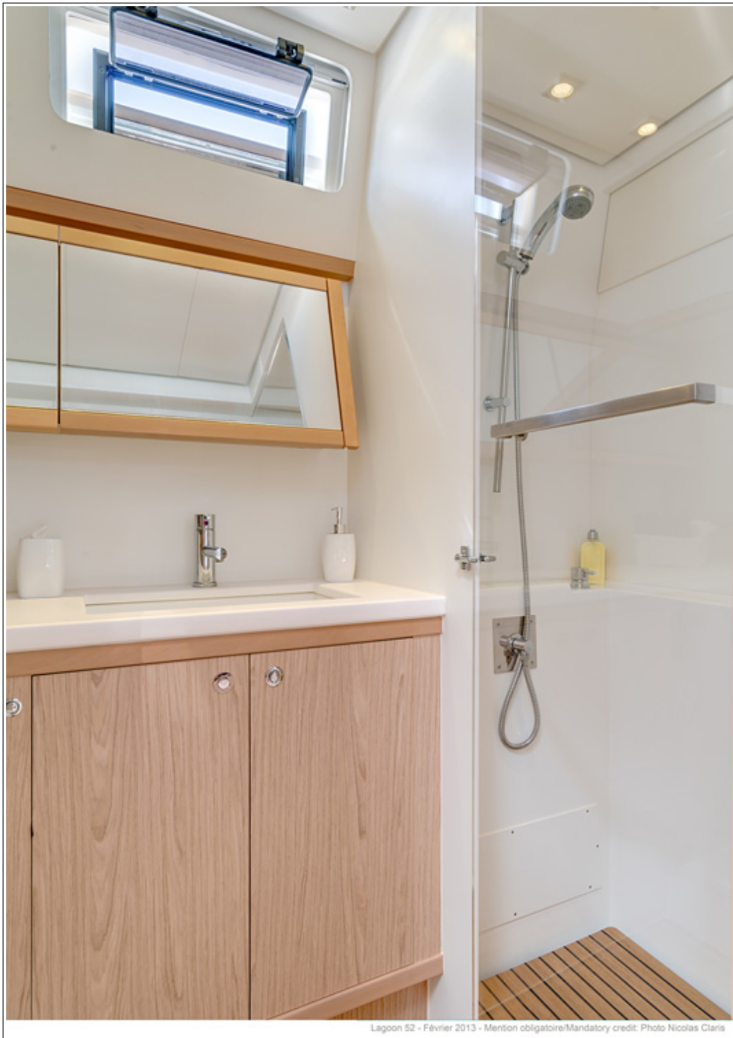
Lagoon 52 - Février 2013 - Mention obligatoire/Mandatory credit: Photo Nicolas Clans