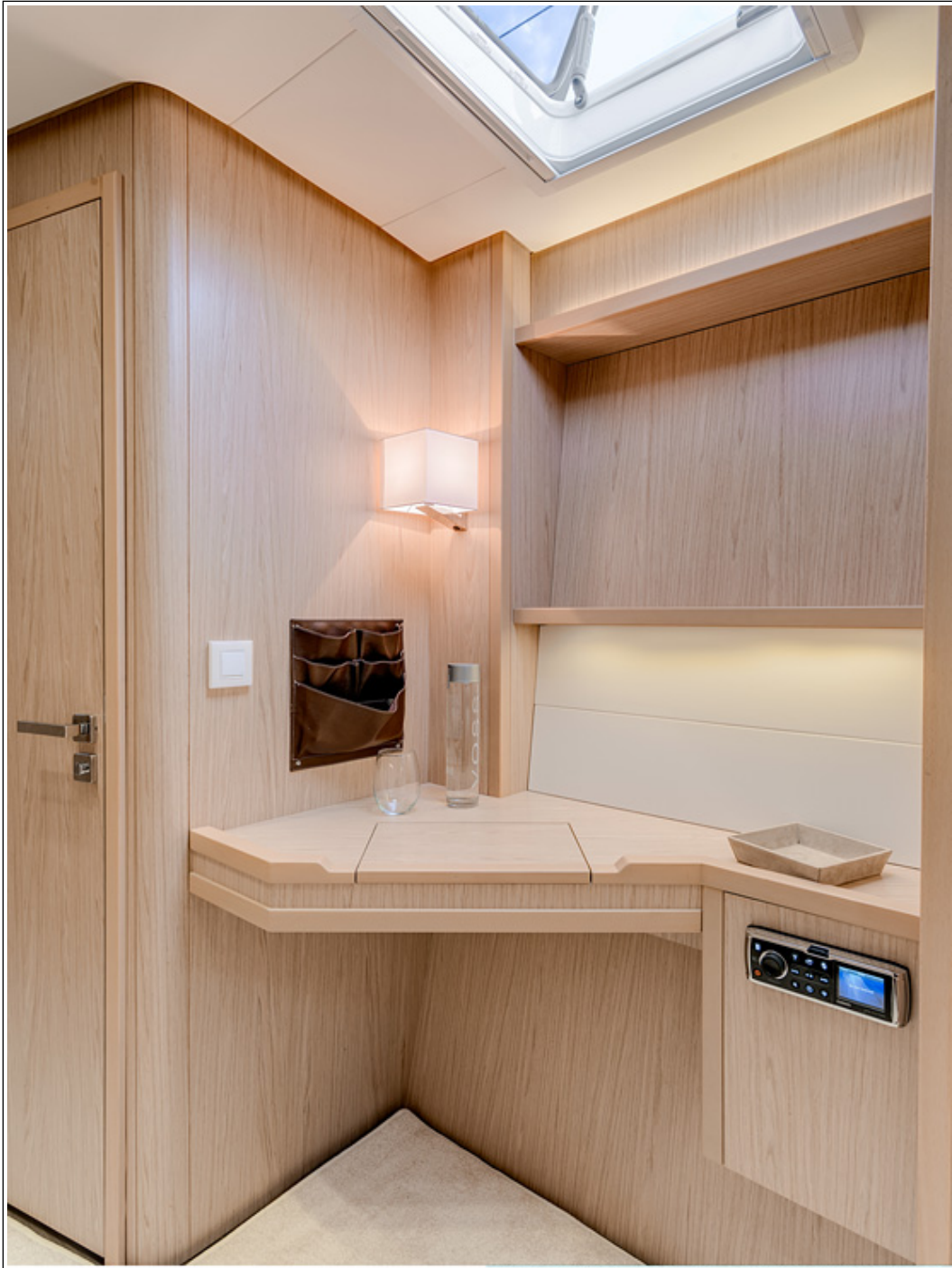
Lagoon 52 - Février 2013