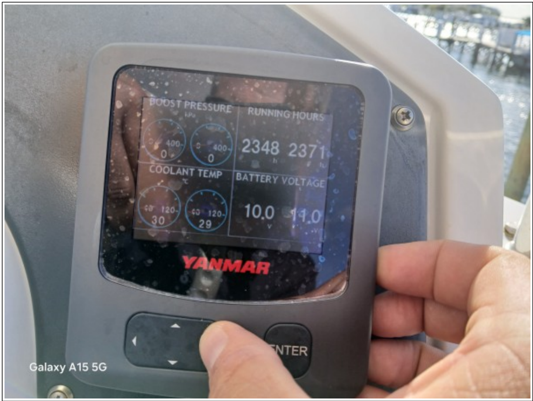
Galaxy A15 5G