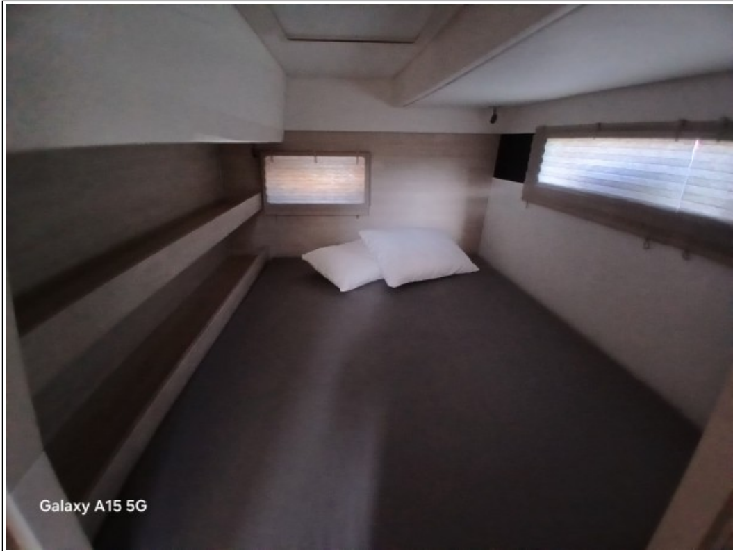
Galaxy A15 5G