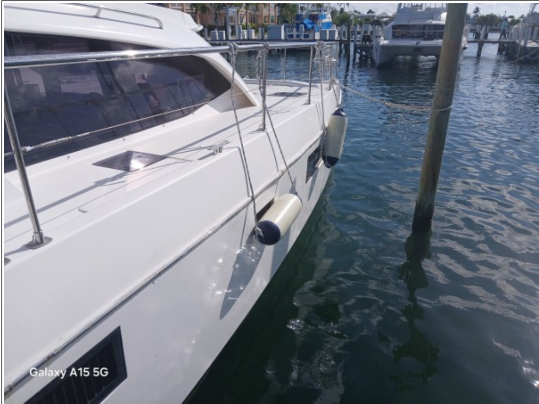
Galaxy A15 5G