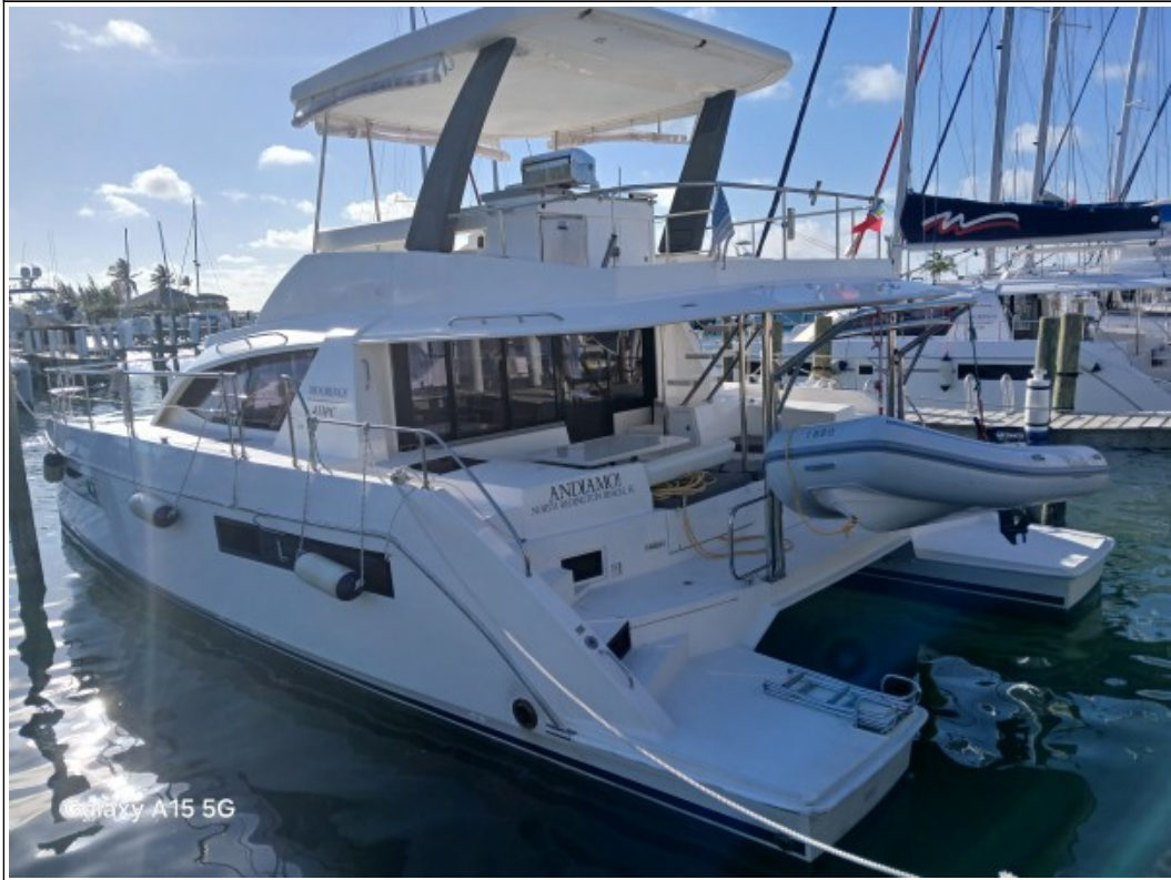
Galaxy A15 5G