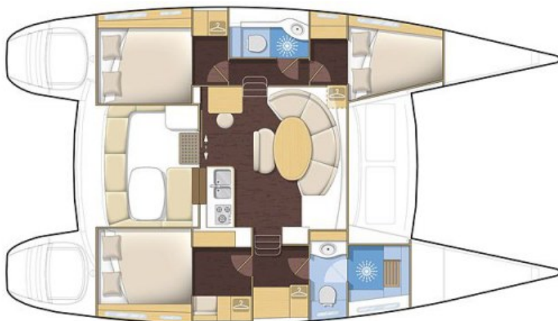
Version propriétaire / Owner's version