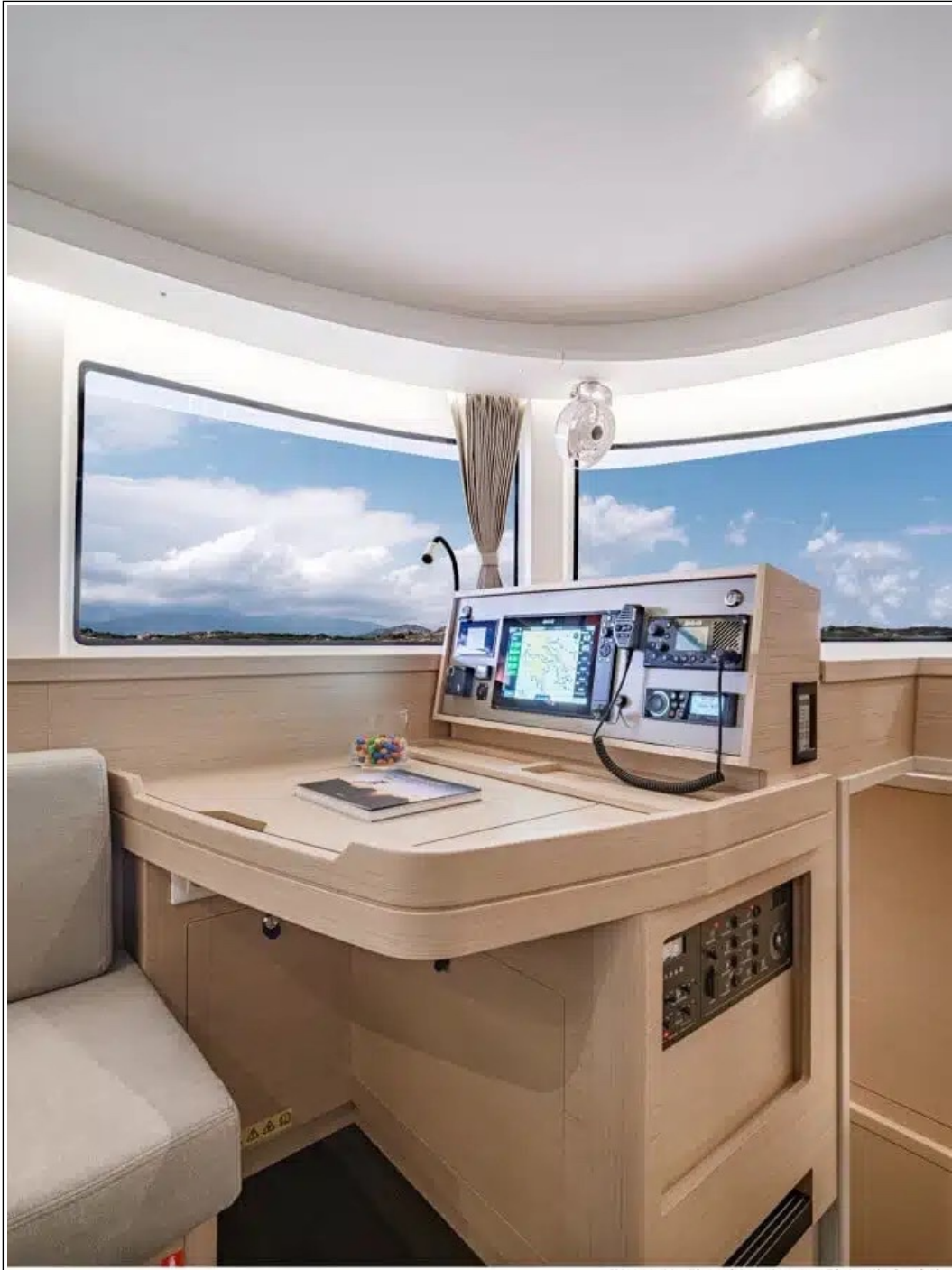
Lagoon 42