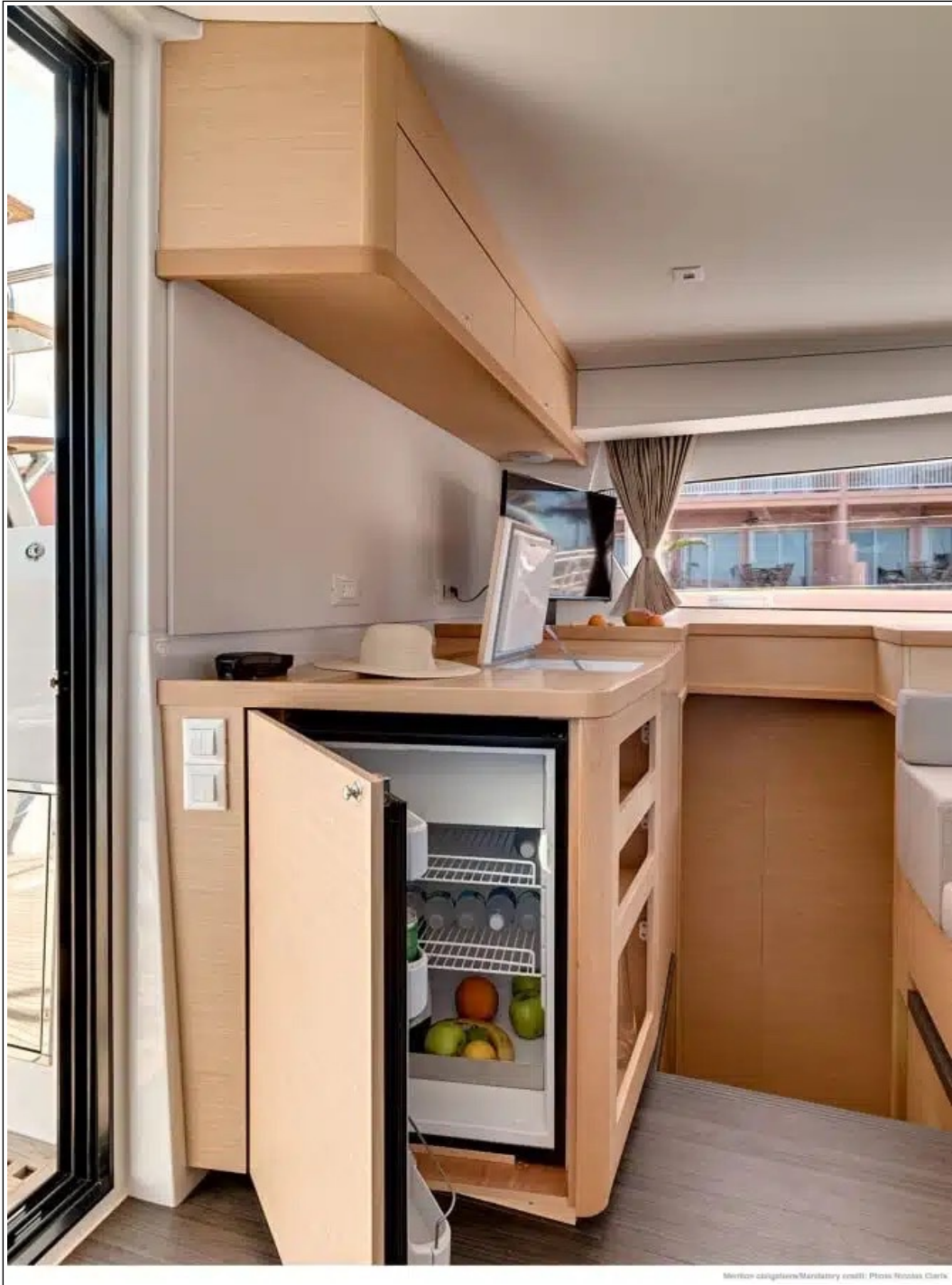
Meriton Singapore/Mandatory email: