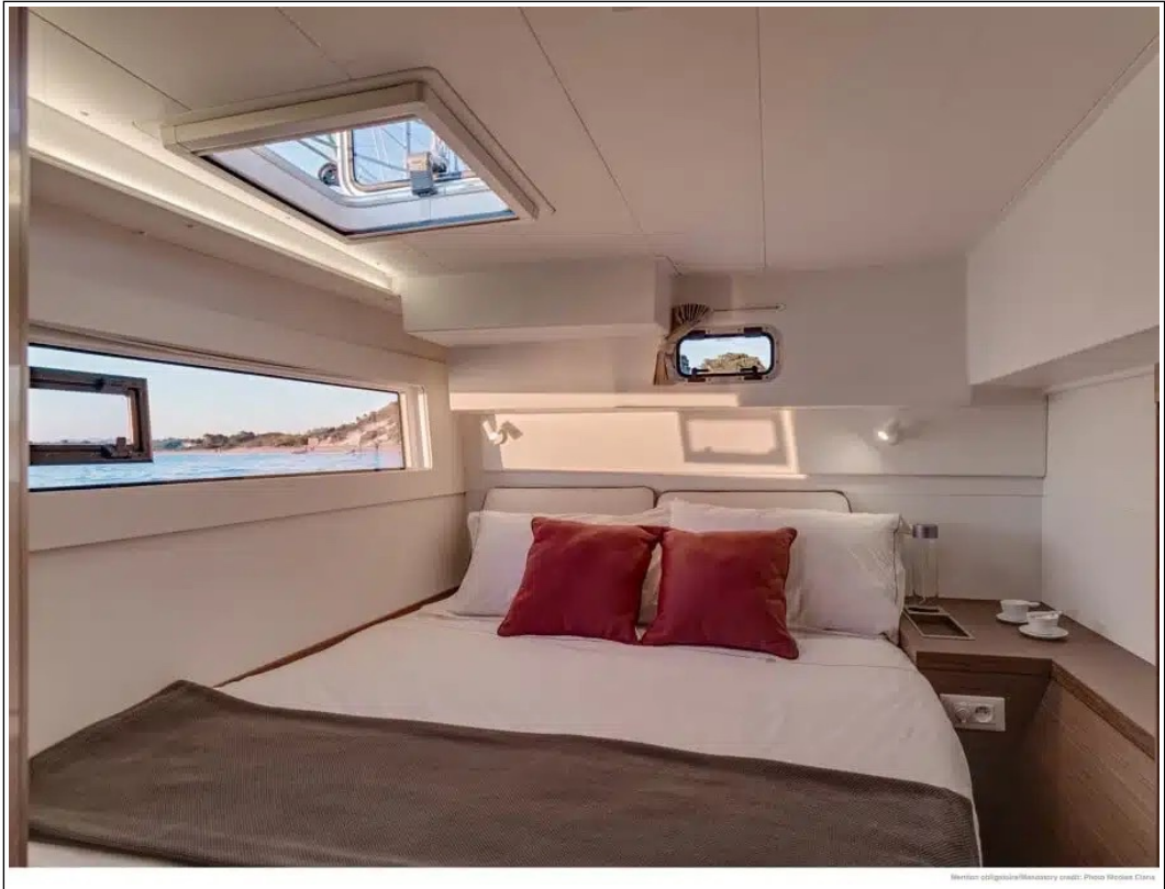
Beneteau Antares 40 (Beneteau)