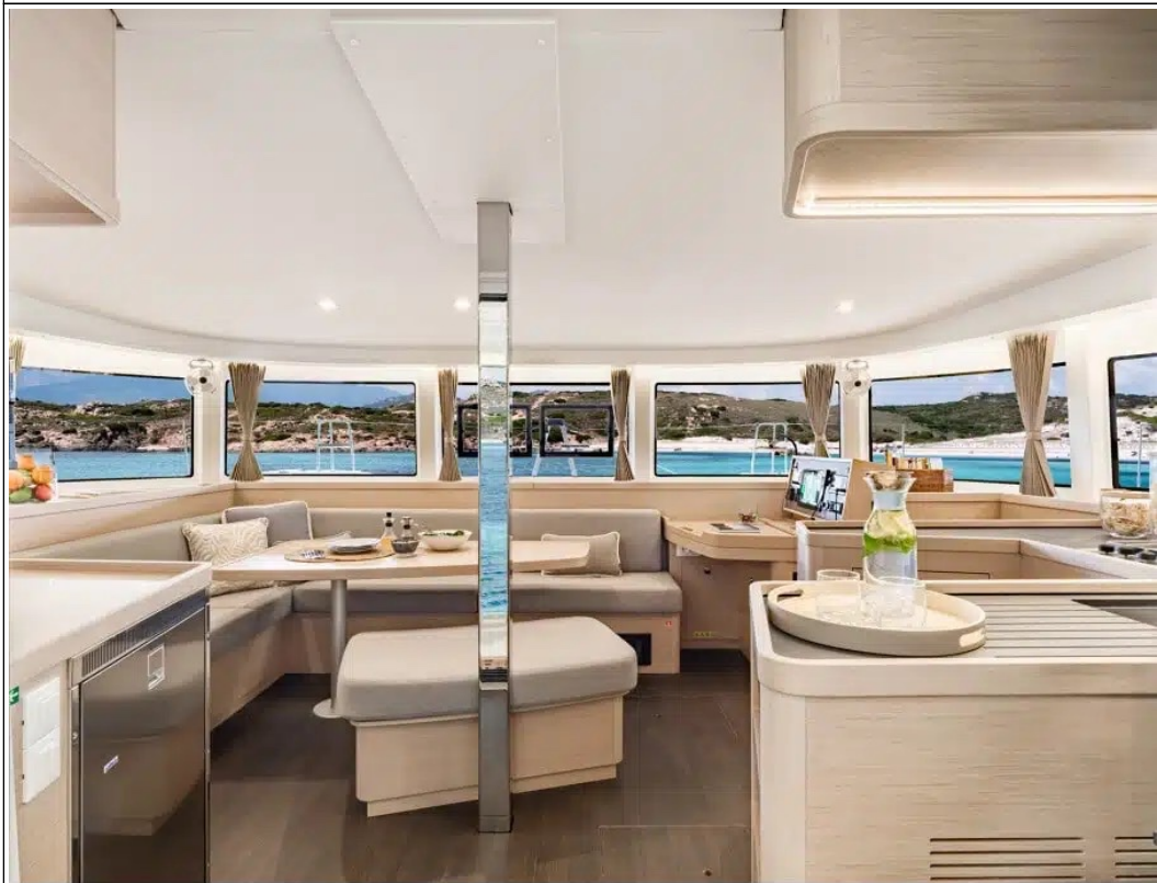
Lagoon 42