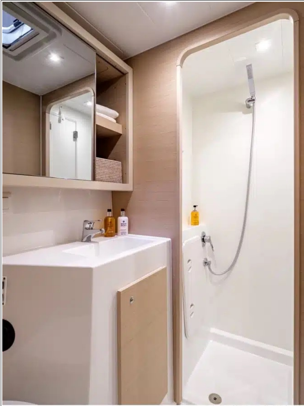
Lagoon 42