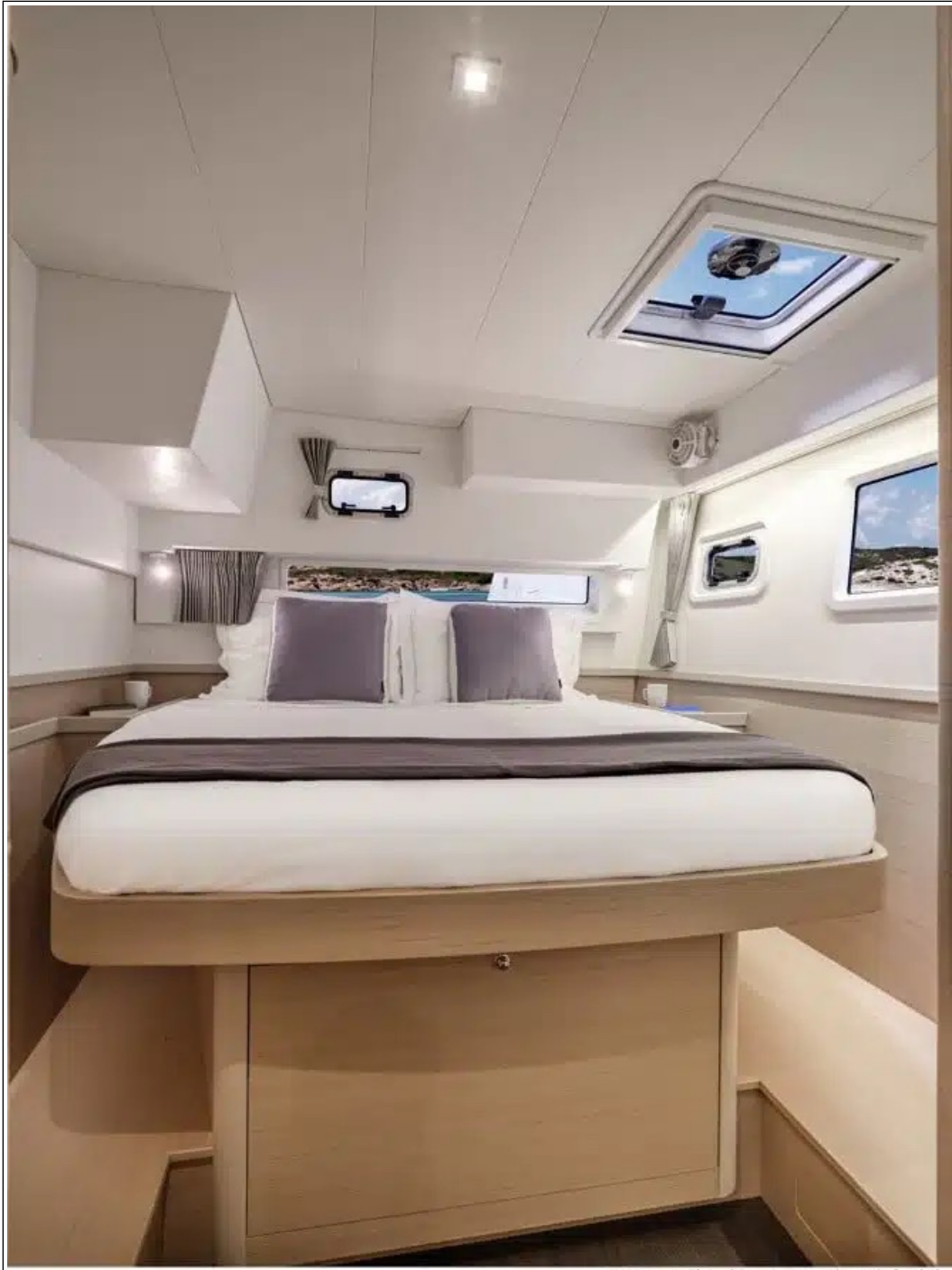
Lagoon 42