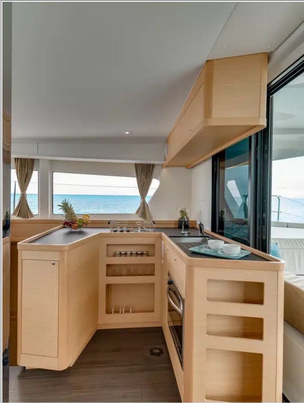
Version originale/Mandatory credit: Photo Nicolas Denis