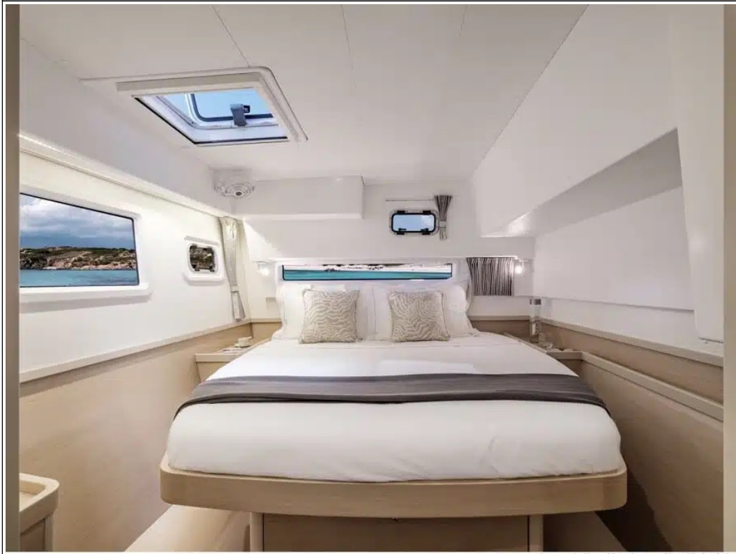
Lagoon 42