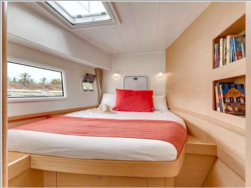
Mermaid (Lagoon) (Mermaid) (2018)