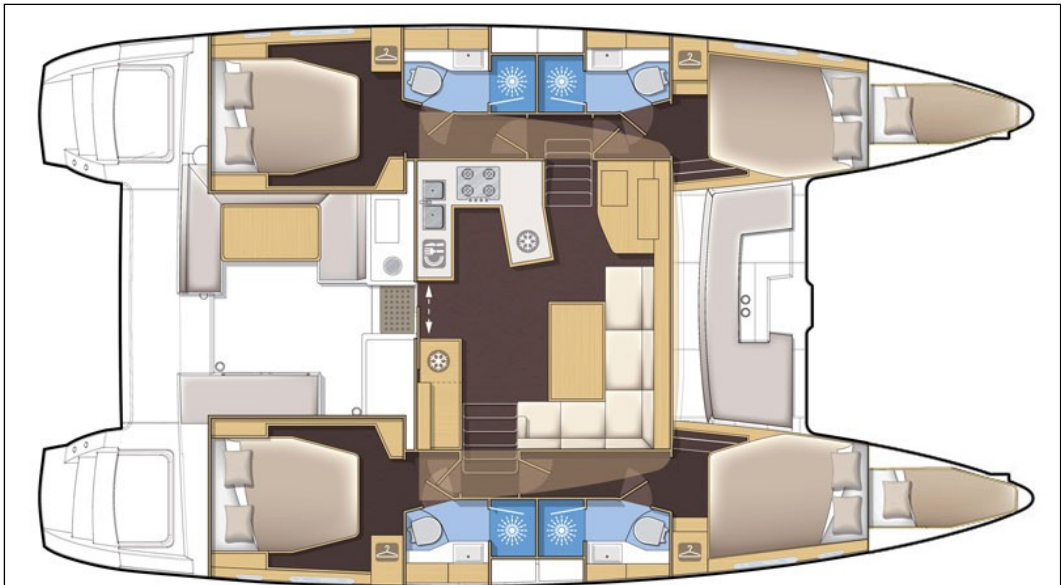
Version 4 cabines / 4 cabin version