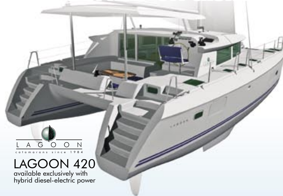
LAGOON catamarans since 1984 LAGOON 420 available exclusively with hybrid diesel-electric power

WITH A HYBRID DIESEL-ELECTRIC CATAMARAN YOU CAN KEEP ON CRUISING