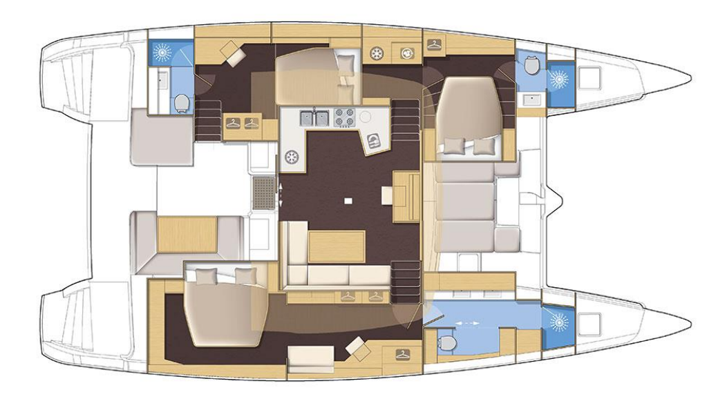
Version 3 cabines / 3 cabin version