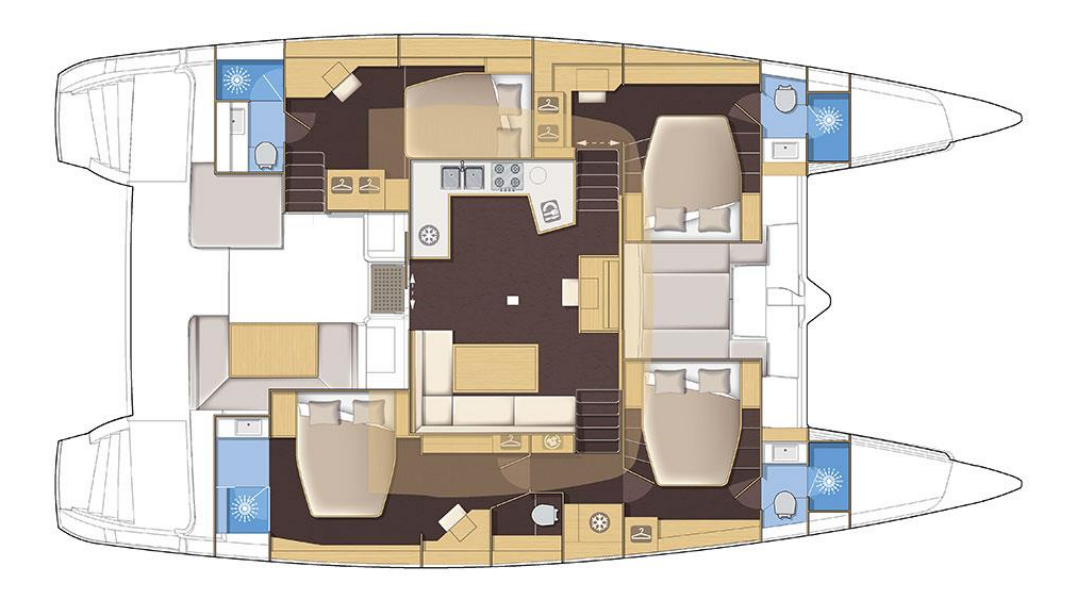
Version 4 cabines / 4 cabin version