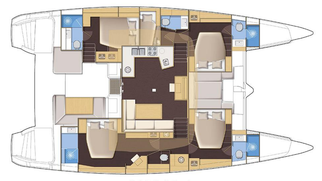
Version 5 cabines / 5 cabin version